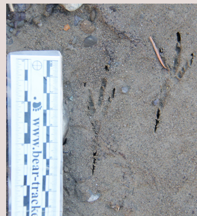
Scrub jay tracks