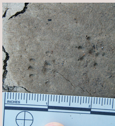
Roof rat tracks