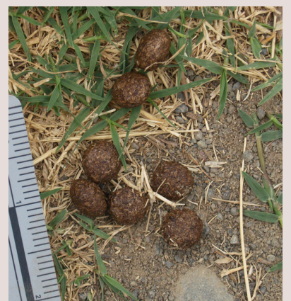
Blacktailed jackrabbit droppings