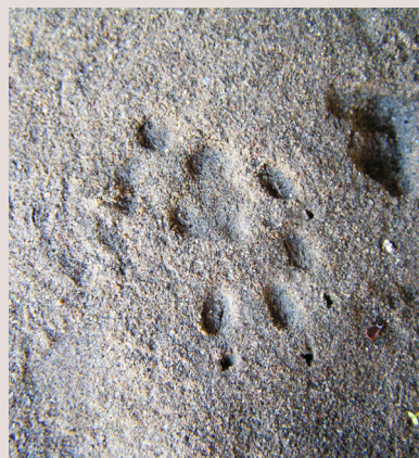
Ground squirrel tracks