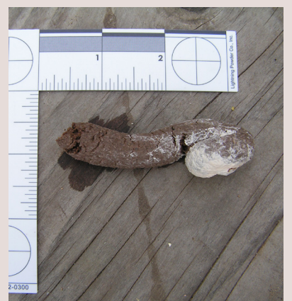
Wild turkey droppings

These photos are examples. Actual signs can vary greatly.