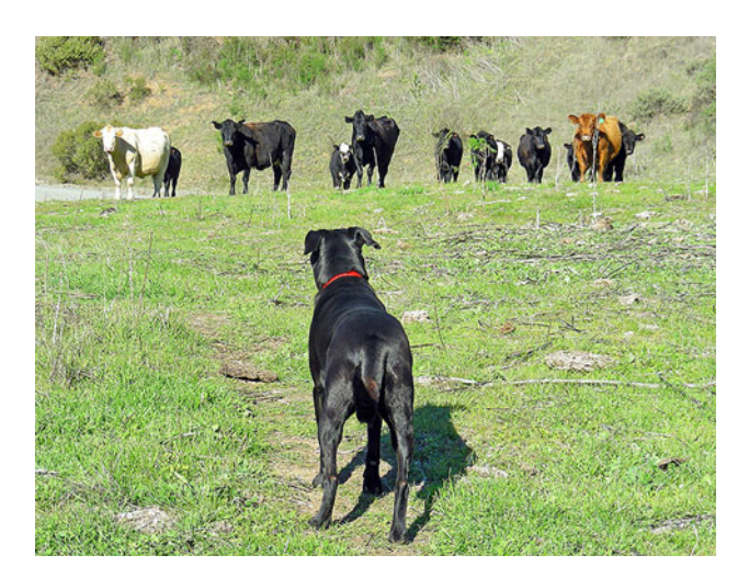
Fig. 2 "Moment of Truth—and she was face to faces with this small herd..."

1,087 photos (Table 1). Of these, 733 photos included comments, and there were 956 comments categorized.