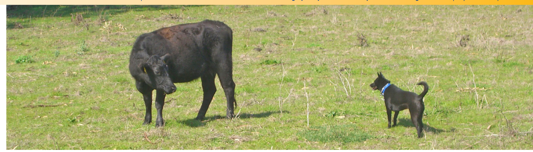
Cattle perceive a dog as a predator. Don't allow you dog to chase or harass cattle. Photo: Mary Mactavish/Fickr.

Due to their size, cattle seem more intimidating than sheep and goats to most people. Cattle are the most prevalent livestock animals on park and open space lands in the Bay Area and in California overall. A mature dairy cow can weigh as much as 1,500 pounds, and a mature beef animal generally weighs 1,200 to 1,400 pounds. Sheep and goats are closer in weight to humans, at about 100 to 150 pounds for an adult animal.