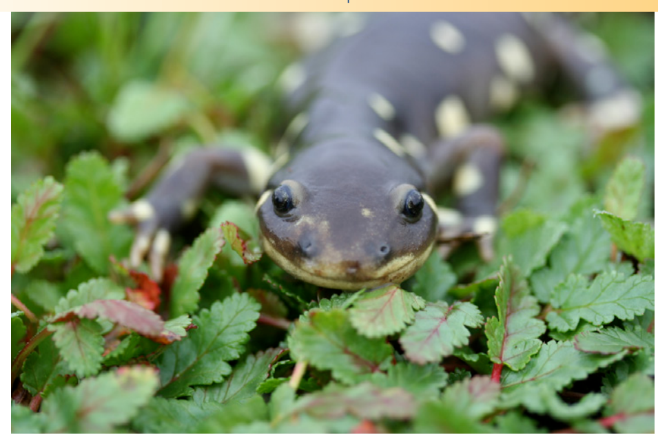
California tiger salamander.

more suitable for California ground squirrels (USFWS 2003). Salamanders that inhabit vernal pools may also benefit from grazing. These ephemeral pools are wet only during the winterspring rainy season, and too much vegetation in and around their edges can cause drying pools to lose depth too quickly. Because it reduces this vegetation, grazing can keep the pools wet longer, giving salamander larvae more time to grow up (USFWS 2004).