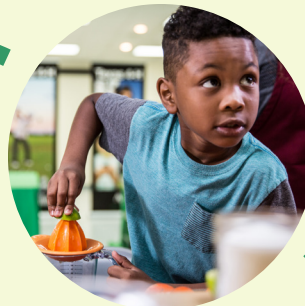
Cooking & Eating Healthy