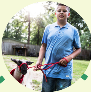
Raising & Taking Care of Animals