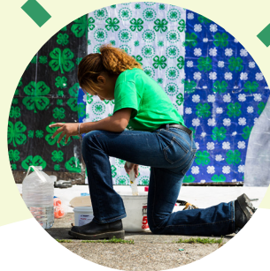
Helping Your Community