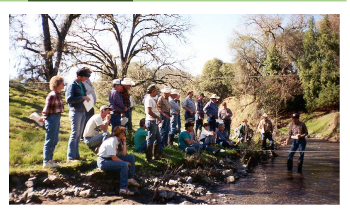
Figure 2: Water Quality Planning Short Course, Mendocino County