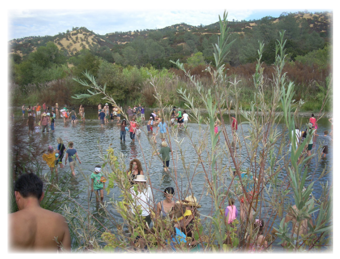
Festival attendees in the river - Hoes Down Festival

Farmers sometimes forget that simply getting out of town and into the natural world can be a treat to urban and suburban visitors. A chance to play in the river or see the night sky from an orchard campsite is a much appreciated part of a farm festival experience for many.