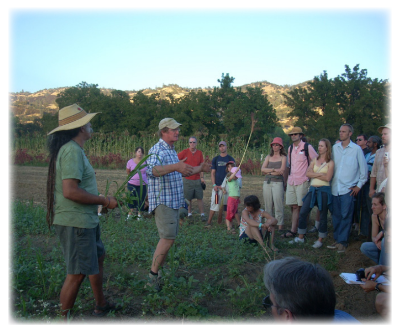
Farm Tour at the Hoes Down Harvest Festival

• Petting zoo – 4H club brings animals and runs the petting zoo. The group charges $1.00 per person and gets to keep the proceeds.