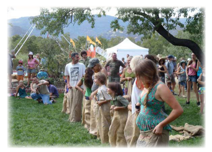
Sack races at the Hoes Down Harvest Festival

This guide will not attempt to teach management of large entertainment events with multiple concessions and attractions, many employees and many thousands of visitors. To learn from successful organizers of these larger events, consider joining the North American Farmers' Direct Marketing Association (NAFDMA). Some resources for planning corn mazes and pumpkin patches are at the end of this guide. This guide also does not include festival marketing advice.