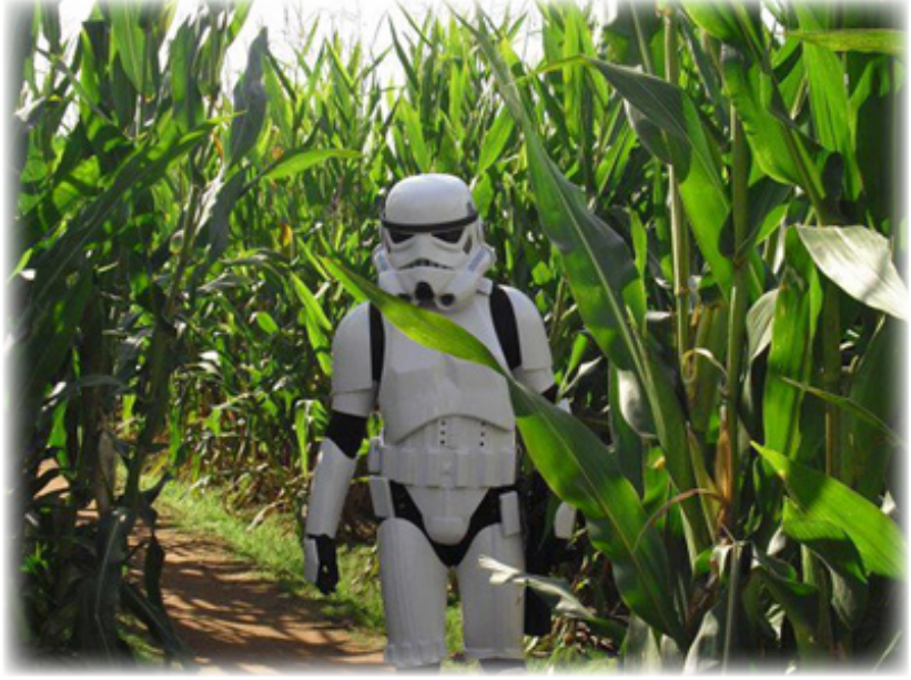
Actor in the Nash Ranch Pumpkin Festival Corn Maze