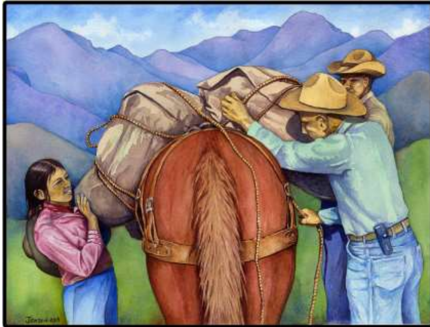
Packing Our Youth Into The Future