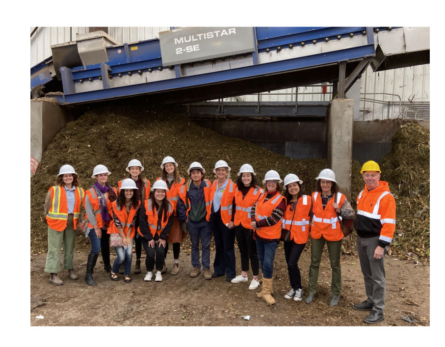
Escondido Disposal, Inc. Anaerobic Digestion Facility