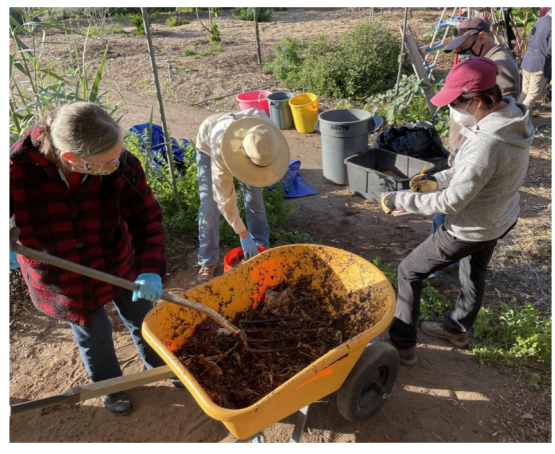
Escondido, January 2022