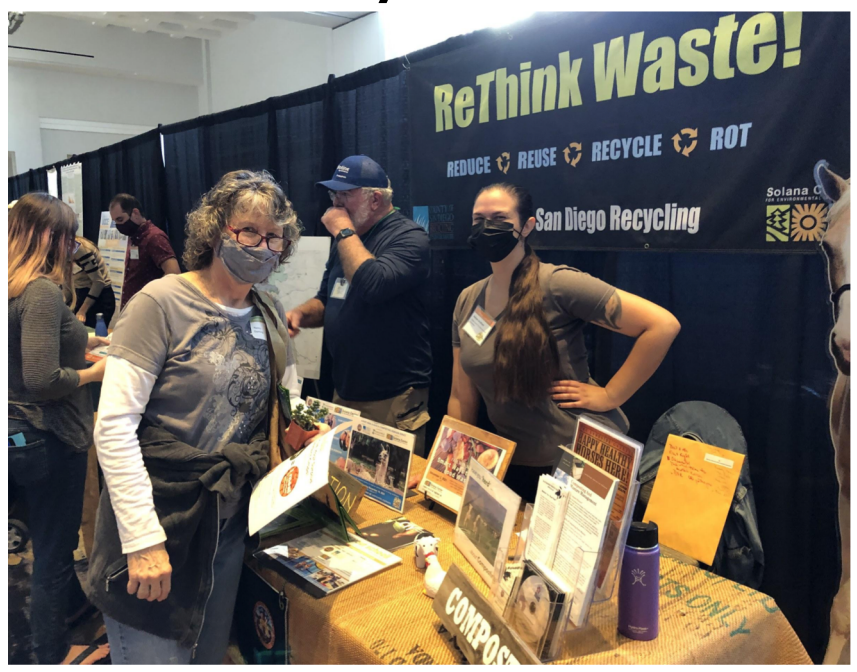
Farm & Nursery Expo, November 2021

Get the Word Out: Community Event Booths