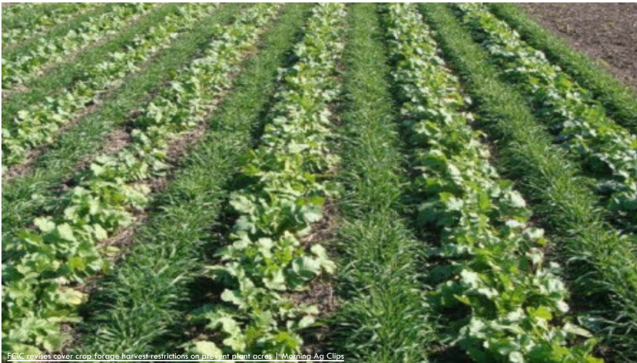
FCLC revises cover crop forage harvest restrictions on prevent plant acres | Morning Ag Clips