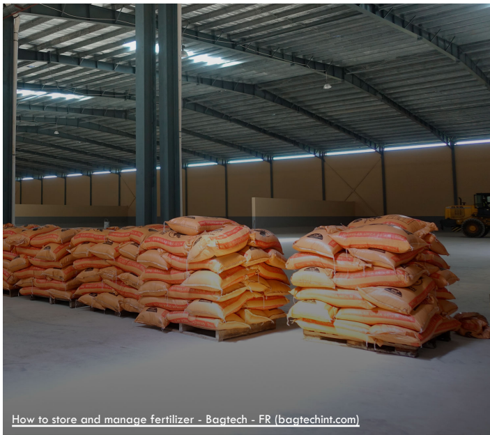
How to store and manage fertilizer - Bagtech - FR (bagtechint.com)