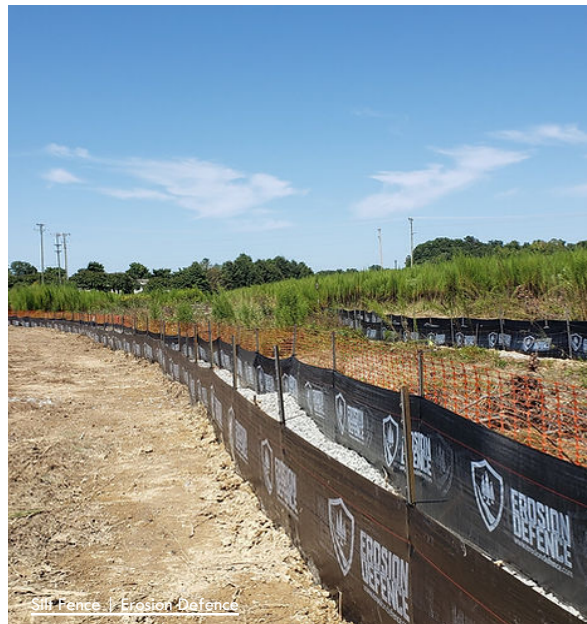
Silt Fence | Erosion Defense