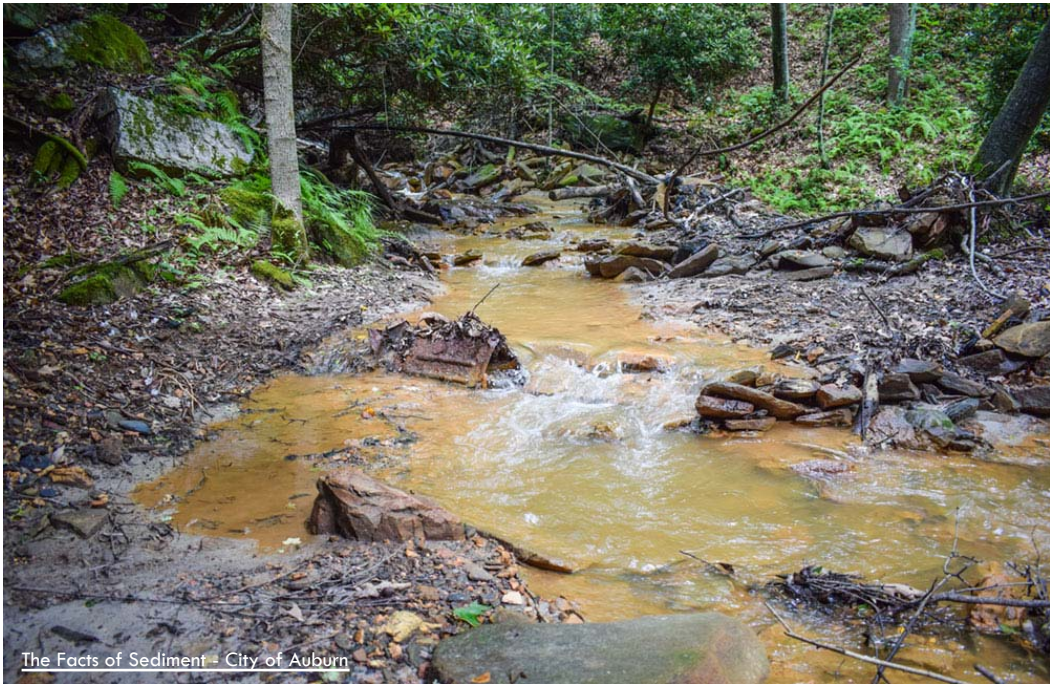
The Facts of Sediment - City of Auburn

Any soil that is not protected by rainfall or runoff may be vulnerable to erosion and become a source of sediment pollution in surface water bodies.