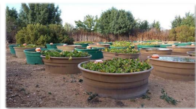
Evaluating effects of aquatic weeds on mosquito populations