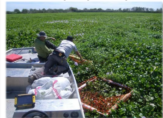
Evaluating management using herbicides