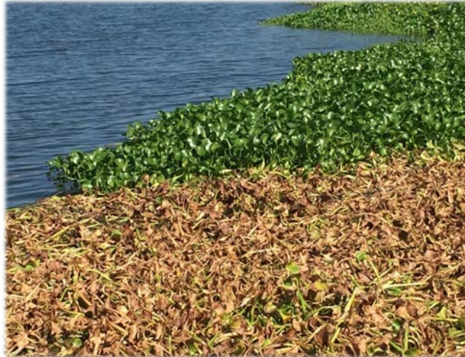
Monitoring dissolved O 2 following management