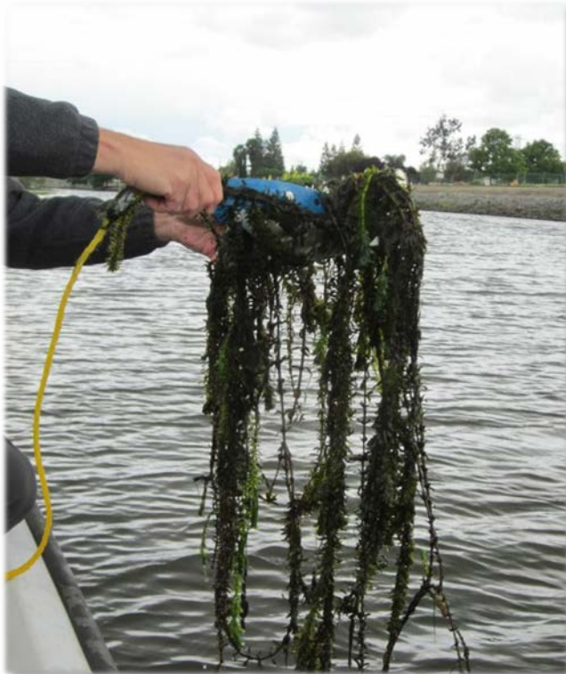
Monitoring progress of Egeria control efforts