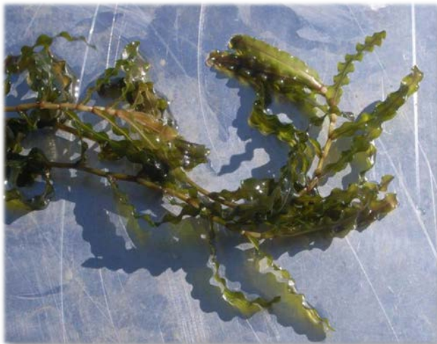
Tracking curlyleaf pondweed