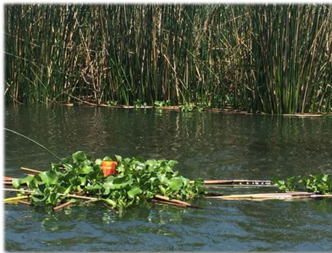
Monitoring movement of waterhyacinth