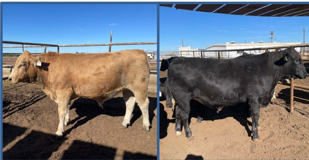
Finished Charolais-Holstein steer (left) and crossbred Angus-Holstein steer (right) one day before harvest.

Angus-Holstein crossbred steers had increased performance and improved carcass characteristics compared to Charolais-Holstein steers, however feed efficiency and dressing percentage were not different between the two breeds. Continuing to build the database of crossbred beef-on-dairy cattle in the feedlot is critical as sire may play a significant role in productivity and efficiency, as has been seen in other studies.