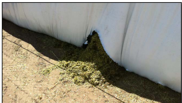
Figure 1. Silage bag ripped at the time of ensiling. Check plastic of piles and bags at the time of ensiling and throughout feedout – repair rips and holes as necessary.