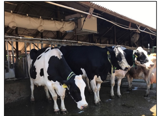
Cows line up to receive cooling from innovative direct evaporative coolers at the UC Davis dairy.

Two new and innovative methods of cooling are currently being evaluated at the University of California, Davis. These technologies are designed to reduce water use by up to 86% and energy use by up to 38%, which could potentially result in sizeable economic and resource savings for the dairy industry. The two technologies were tested in comparison to the traditional soaker and fan combination at the university dairy this summer. The researchers are now in the process of analyzing data to determine which technology was the most effective and efficient when cooling the cows. One of these technologies will be tested on a commercial scale in the Central Valley, next summer. Water and energy use, as well as production, will be quantified in this test to evaluate cost effectiveness.