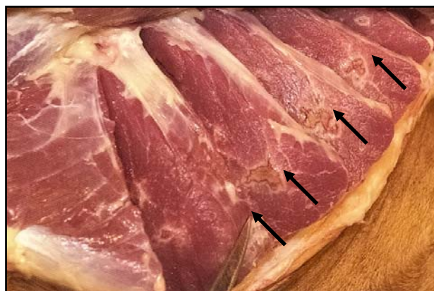
Figure 1. Arrows point to injection site lesions that span cuts of beef.