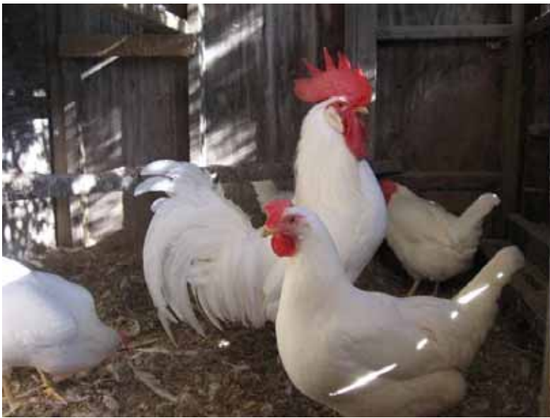
Light/ Egg Breeds