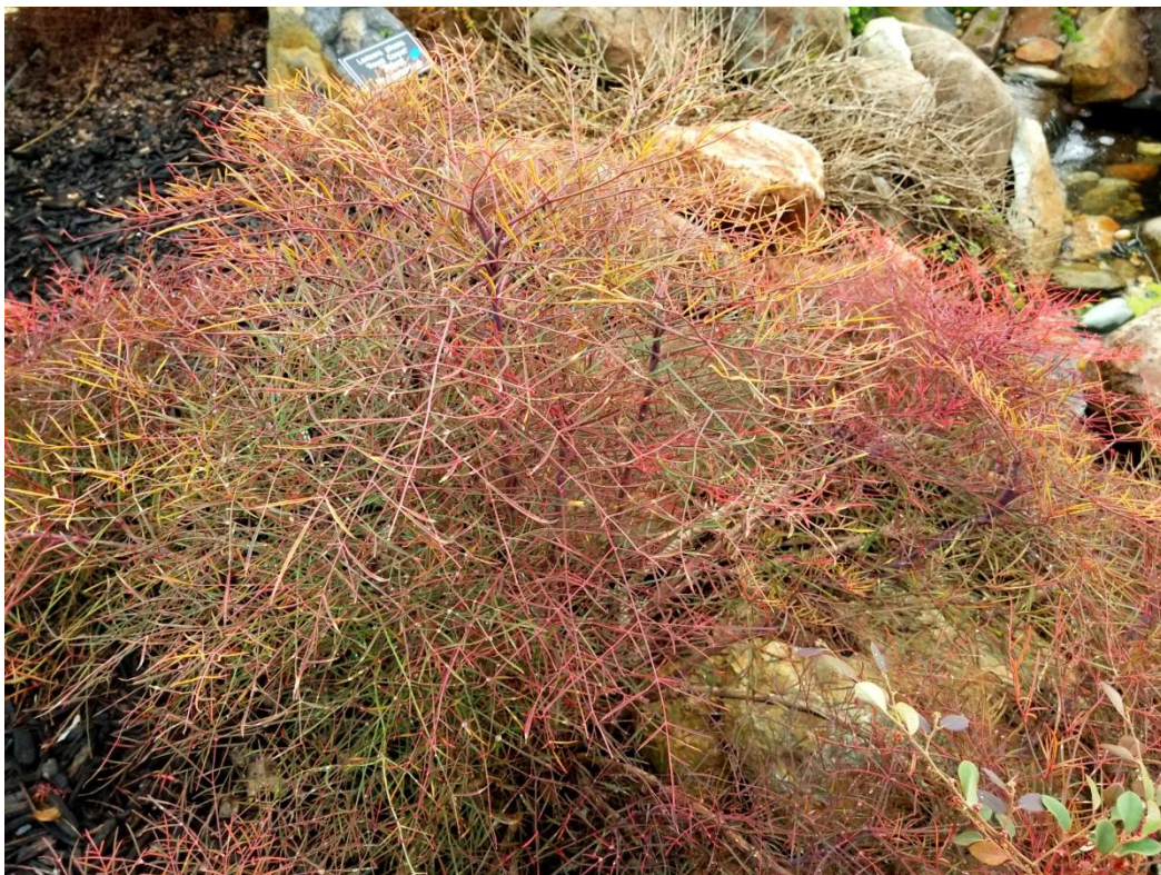
Winter - Nandina domestica , 'Filamentosa' - dwarf Threadleaf Nandina

Another shrub in the Japanese Garden that has great bones is this Dwarf Thread Leaf nandina. In winter the stems are a kaleidoscope of colors!