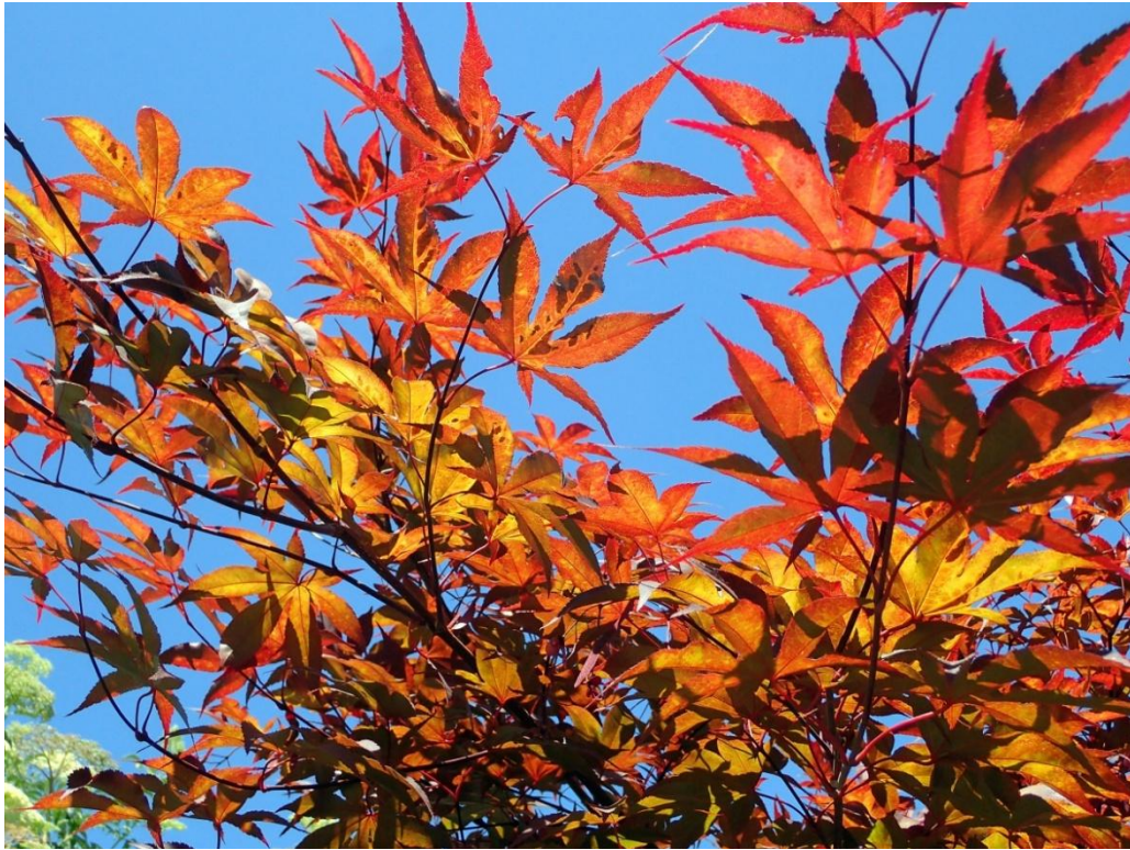
Fall colors - Acer palmatum , 'Sango Kaku' - Coral Bark Japanese Maple

Another shrub in the Japanese Garden that has great bones is this Dwarf Thread Leaf nandina. In winter the stems are a kaleidoscope of colors!