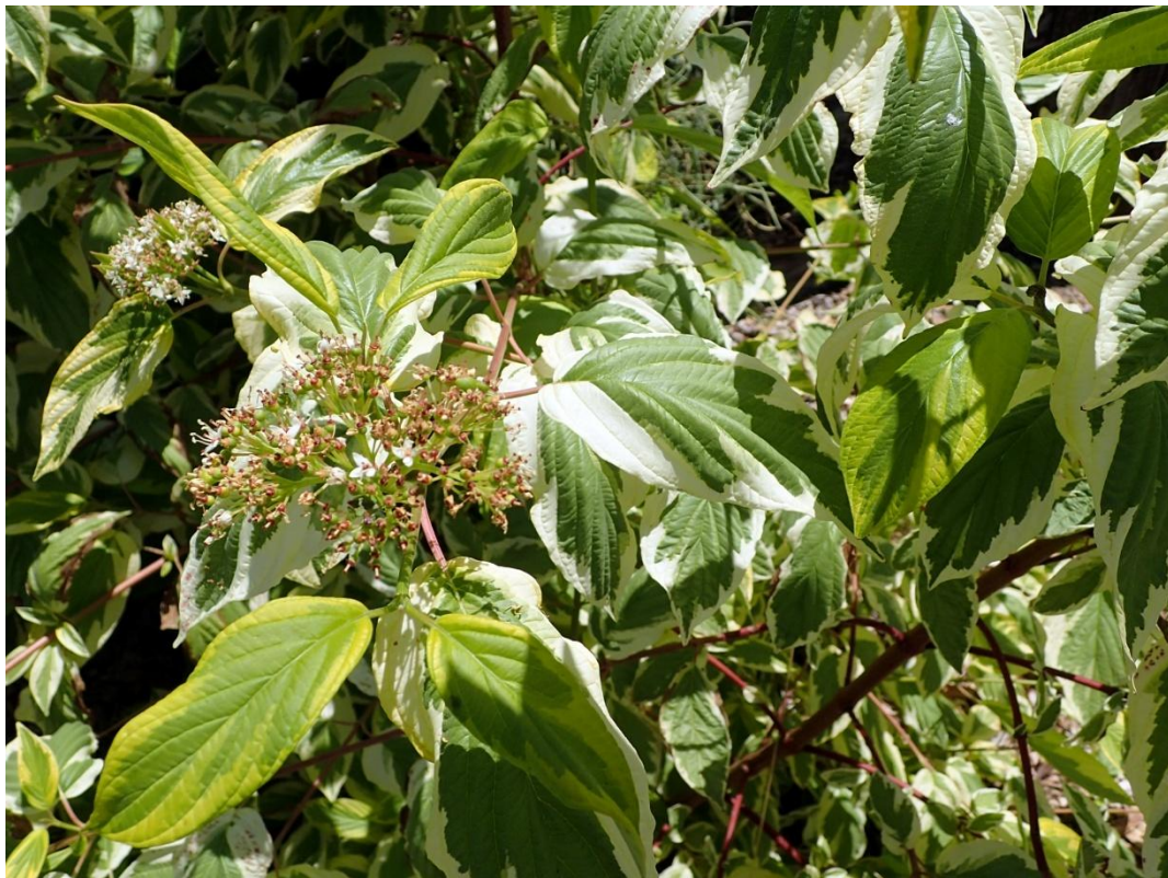
Early summer blooms - Cornus alba 'Elegantissima', Variegated Redtwig Dogwood