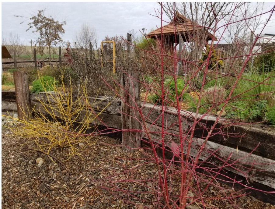
Cornus alba 'Elegantissima', Variegated Redtwig Dogwood Cornus sericea , 'Flaviramea', Yellowtwig Dogwood

Shrubs can also bring year round interest. These Redtwig and Yellowtwig dogwood shrubs are bright red and yellow stems in winter and can "pop" in your garden when placed to advantage. The Marsh and Shade Garden both have samples of Redtwig Dogwood.