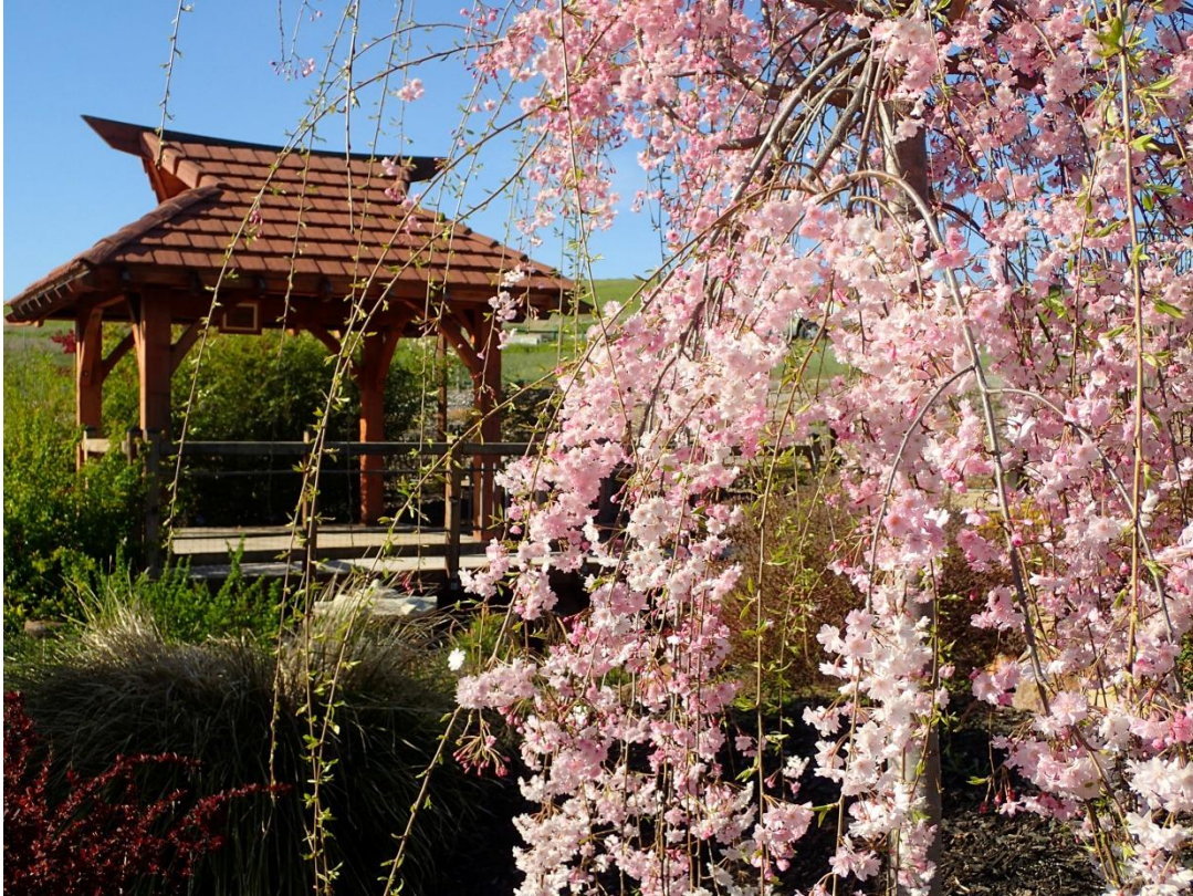
Prunus x subhirtella 'Pendula Plena Rosea' (Double Weeping Flowering Cherry)

This Weeping Cherry also has year-round interest. There are other weeping type trees such as weeping Japanese maples.