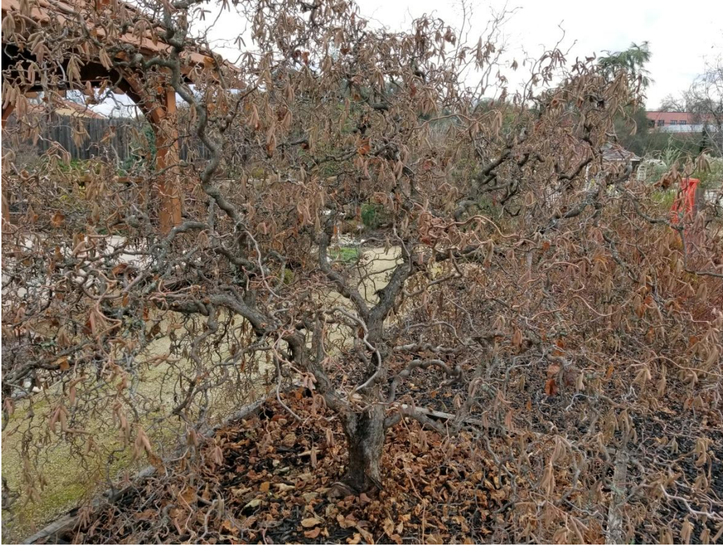
Corylus avellana 'Contorta' - Harry Lauder's Walking Stick

Another favorite within the Sherwood Demonstration Garden is Harry Lauder's Walking Stick. It is popular for its corkscrew branches and the blooms, or catkins, it produces in spring. There is one planted in the Children's Garden and also in the Japanese Garden.