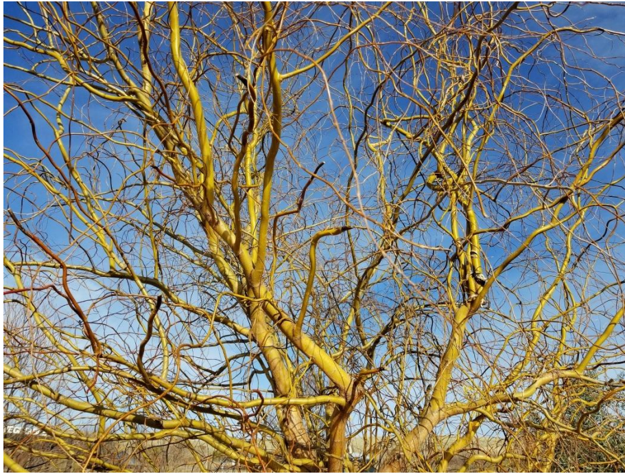
Salix matsudana "Tortuosa" or Corkscrew Willow

Shrubs can also bring year round interest. These Redtwig and Yellowtwig dogwood shrubs are bright red and yellow stems in winter and can "pop" in your garden when placed to advantage. The Marsh and Shade Garden both have samples of Redtwig Dogwood.