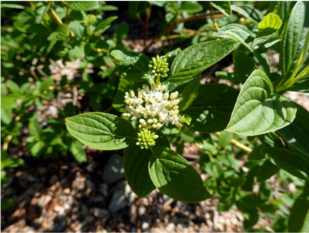
Early summer bloom - Cornus sericea , 'Flaviramea' , Yellowtwig Dogwood