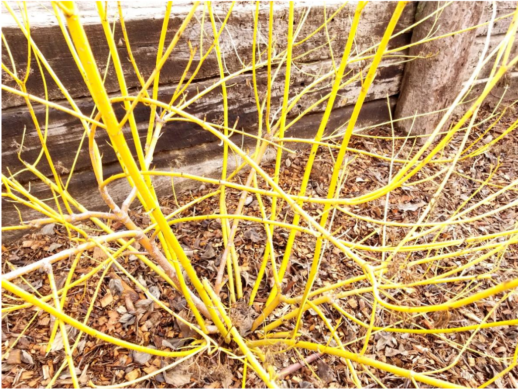
Cornus sericea , 'Flaviramea' , Yellowtwig Dogwood