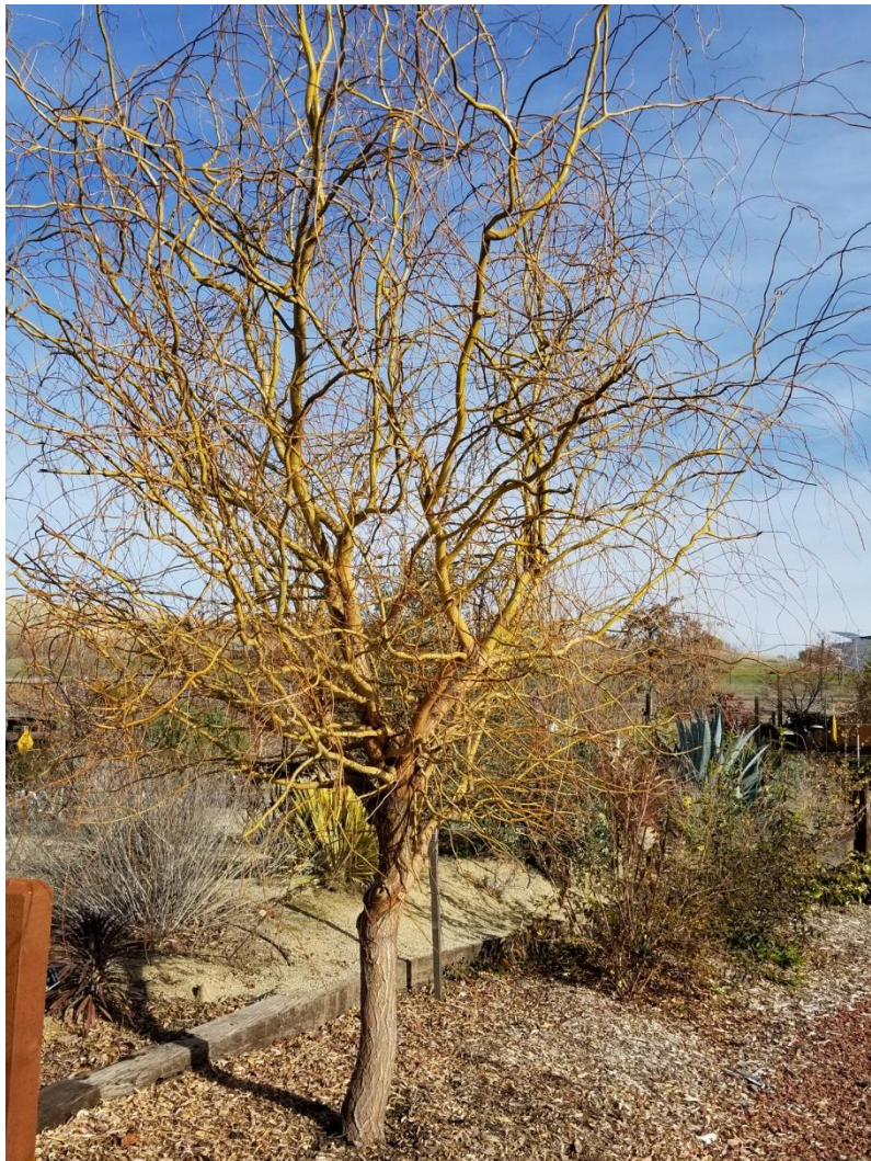
Salix matsudana "Tortuosa" or Corkscrew Willow

This Corkscrew Willow can withstand our hot summers and gives the Marsh shade in summer. In winter its curly, freeform branches are eye-catching.