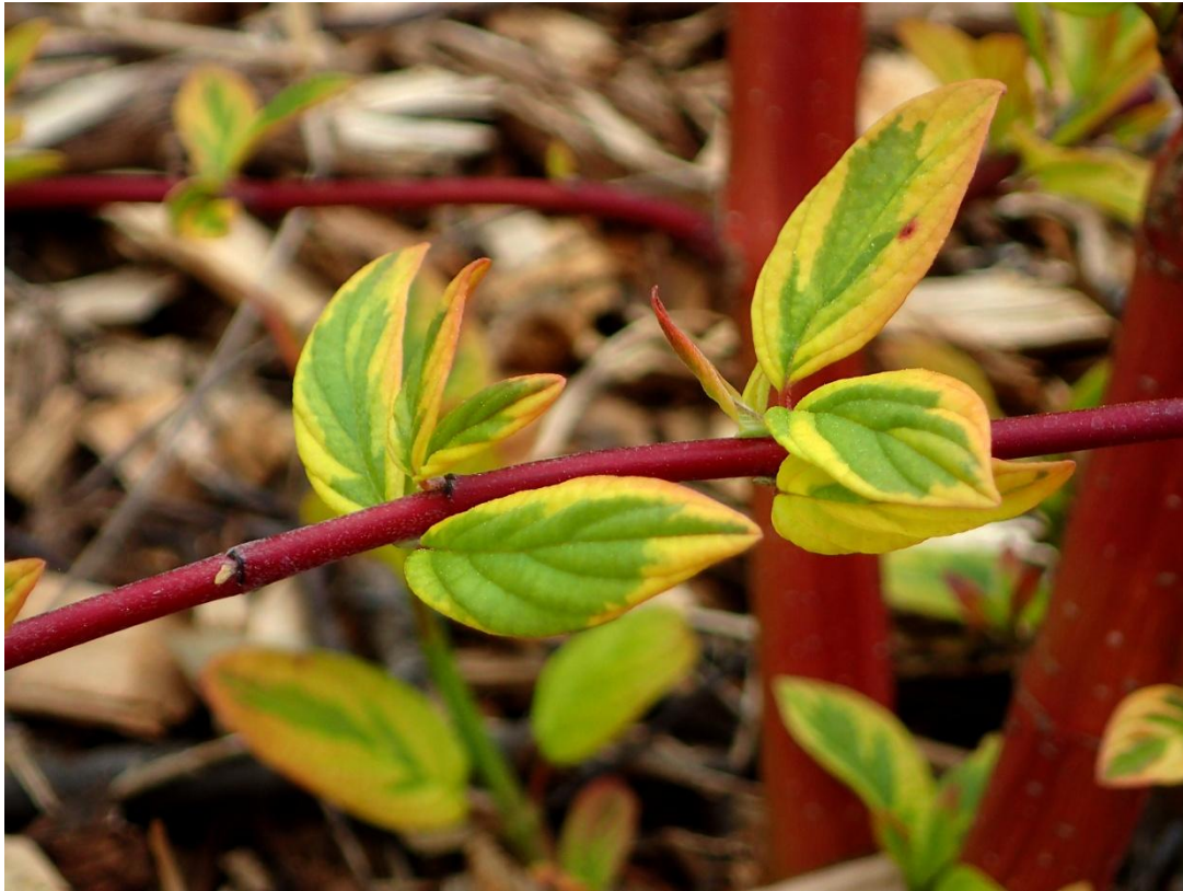
Springtime - Cornus alba 'Elegantissima', Variegated Redtwig Dogwood