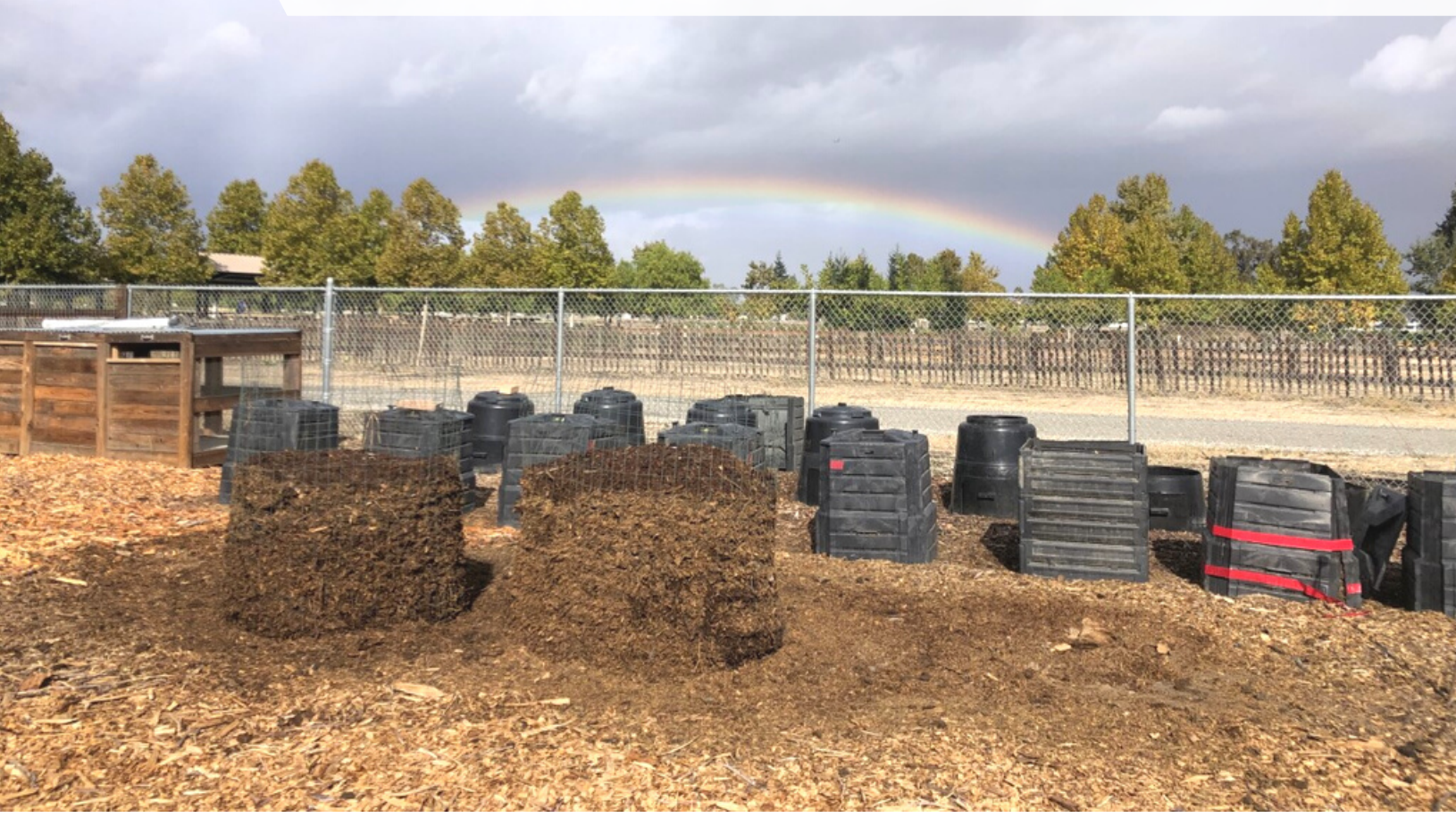
Rainbow after last week's showers