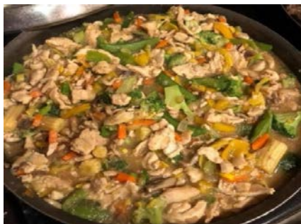
Stir Fry recipe prepared in ESBA class

79% participate in one or more food assistance programs.