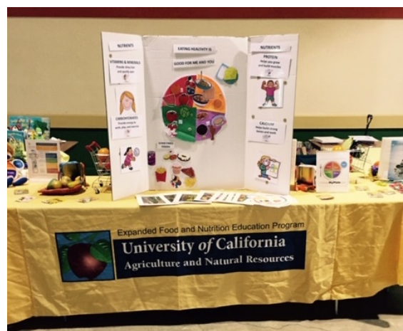
EFNEP Resource Fair Table

74% of participants improved in one or more food safety practices.