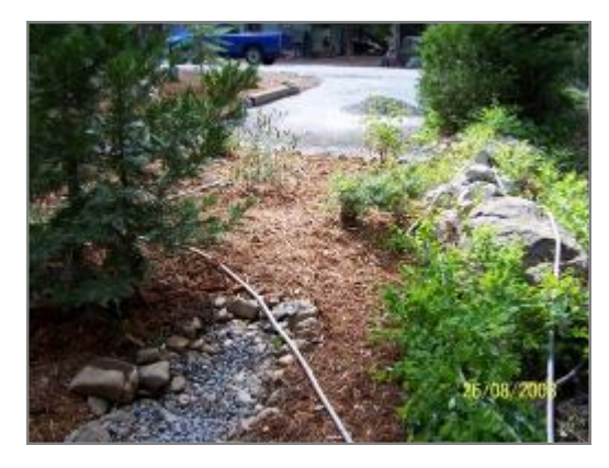
Sample mulching and detention basin options

This free class is at the GSA Building at 12200-B Airport Road in Jackson from 9-Noon. Join us!