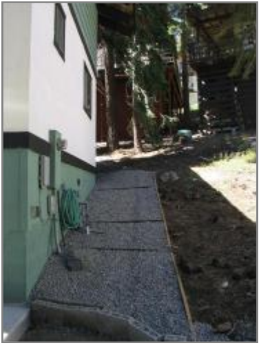
Sample eave line dissipation and infiltration options