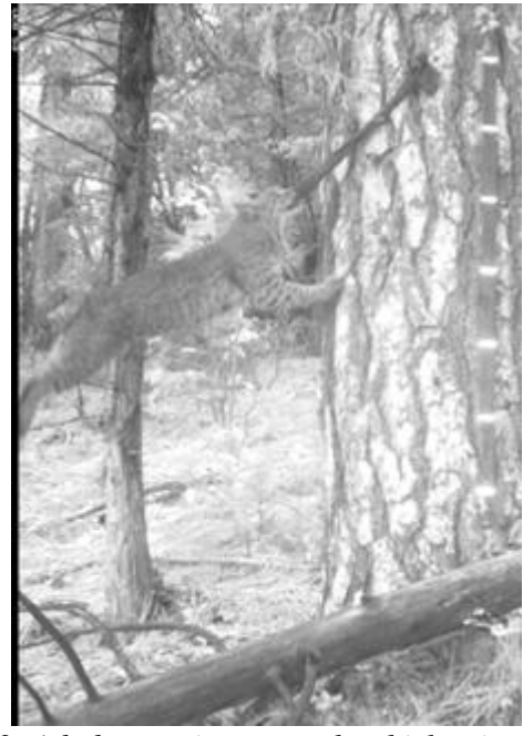
Figure 2: A bobcat trying to get the chicken in a sock.

Other wildlife are also attracted to the bait stations: