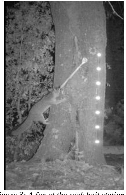
Figure 3: A fox at the sock bait station.