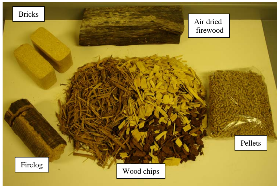
Figure 1. Comparison of the volume of different fuel types needed to produce an equivalent amount of heat.

Densified wood fuels are manufactured to a particular size and shape for a given market. Typically, wood particles are compressed into pellet, log, or brick shapes. Figure 1 shows the relative amount of various fuel types needed to produce about 15,000 Btu of heat.