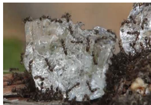
(Shown on gel bait)

You can use a score sheet to record the ratings for each cotton ball.