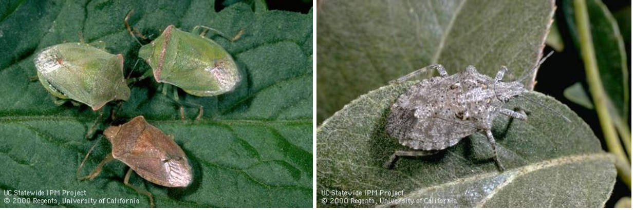
Image 3: Left: Redshouldered stink bug ( Thyanta custator accerra ), green stink bug ( Chinavia hilaris ), and consperse stink bug are some of the large bug pests you may find in your pistachio orchard. Right: Rough stink bug ( Brochymena quadripustulata ), which is a beneficial insect.

Leaffooted bugs (LFB) and stink bugs, due to their larger stature, have larger, stronger mouth parts and can damage developing pistachio nuts after shell hardening as well as before. Research on "hidden damage," or feeding damage to the kernel that does not result in an obvious lesion on the pistachio hull, showed that external