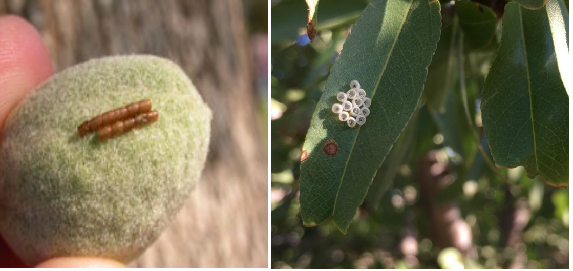
Image 5: Leaffooted bug eggs (K. Tollerup) and stink bug eggs from which nymphs have already emerged.