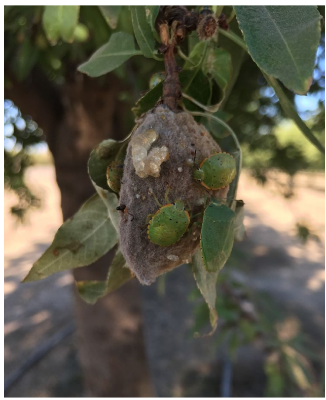
Image 1: Large stink bug populations can lead to significant feeding damage on nut crops, such as these green stink bugs ( Chinavia hilaris ) on almonds.

Anecdotally, UC personnel have heard reports of increased presence of bug species in orchards, possibly because pyrethroid use to control NOW has decreased over the past decade. Over the past few years, we have personally visited a handful of almond orchards that have been heavily hit by stink bugs; one almond orchard I visited was devastated by this pest (Image 1). We do not advocate preventative pyrethroid use to try to keep these insects down. There are very few registered insecticides that control large and small plant bugs and losing them because of evolved resistance from overuse could be devastating. Additionally, using these products can lead to issues with other pests, so it is best to use them only when needed. However, it is important to keep an eye on your orchards to stop these pests once they do appear.