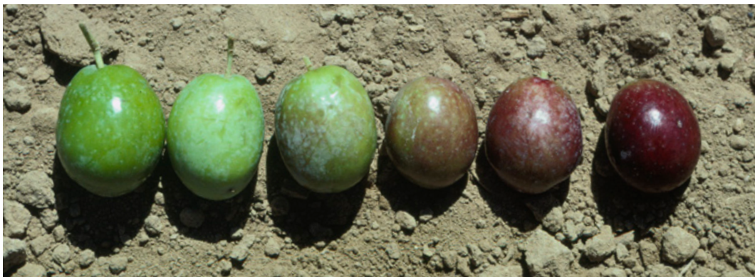
Figure 1. Freshly harvested olives at different stages of ripeness: green-ripe (1 and 2); yellow-green to straw (3); rose to red-brown (4 and 5); and red-brown (6) (may be too soft for some types of olive curing). Not shown are naturally black ripe olives (also described as dark red to purplish black).

Naturally black ripe olives are harvested in California starting in mid-November and continuing through December, depending on the variety, crop yield, and region, and on weather conditions. When mature, these olives will release a reddish black liquid when you squeeze them and their flesh will be nearly completely pigmented. Ripe olives bruise easily and must be handled with care.