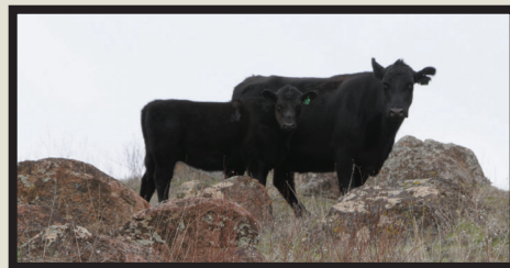
Donati Ranch – Rocky Donati

The Foster Family also grazes for Butte Community College to reduce fire fuel loads, manage invasive weeds and promote native plants. They credit grazing, in combination with the fire breaks they put in, for mitigating the risk to the college during recent fires.