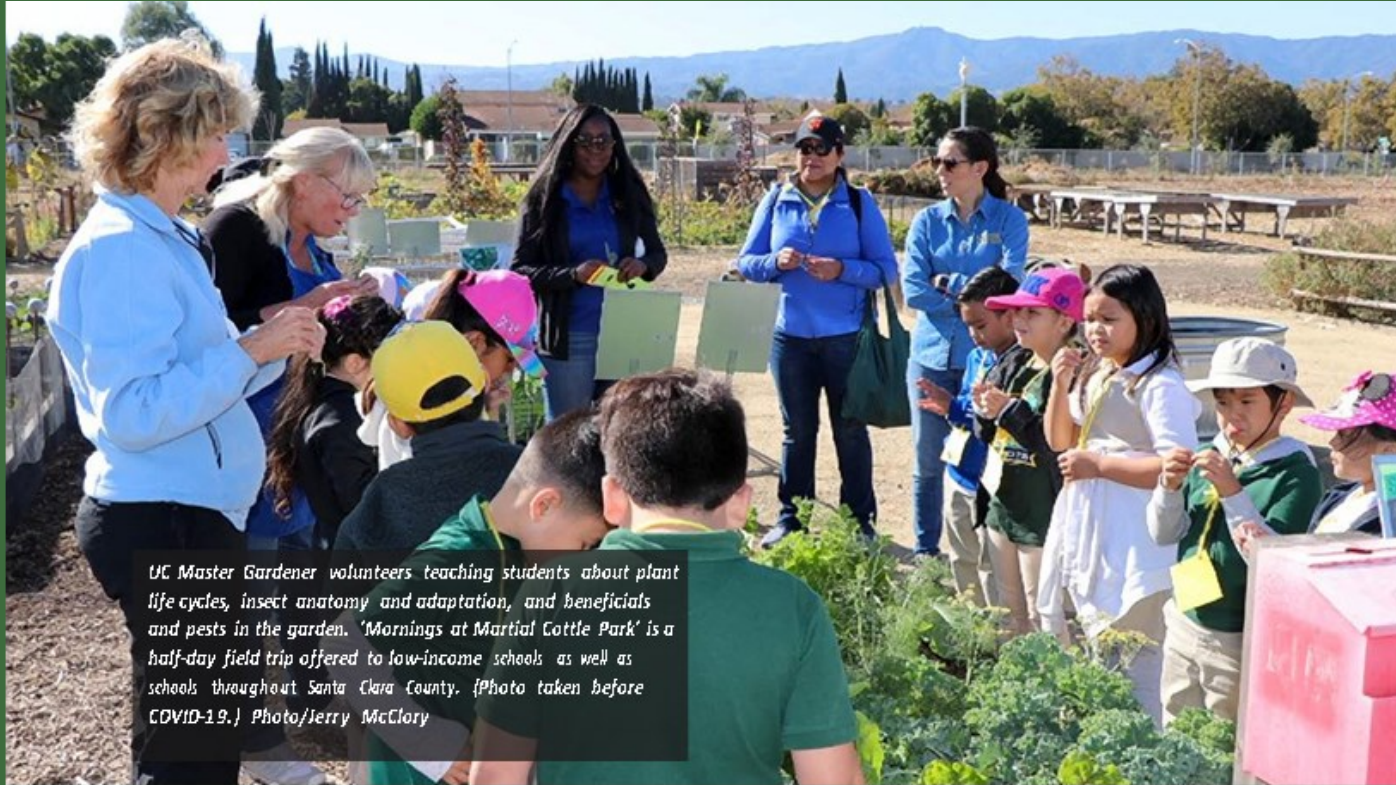
UC Master Gardener volunteers teaching students about plant life cycles, insect anatomy and adaptation, and beneficials and pests in the garden. 'Mornings at Martial Cottle Park' is a half-day field trip offered to low-income schools as well as schools throughout Santa Clara County. (Photo taken before COVID-19.)

UC Master Gardener Volunteers can experience gardening opportunities the program provides: Demonstration Gardens, Propagation at the Grow Lab, Diagnostic Services-Helpline and Farmers Markets, Children's School Gardens.