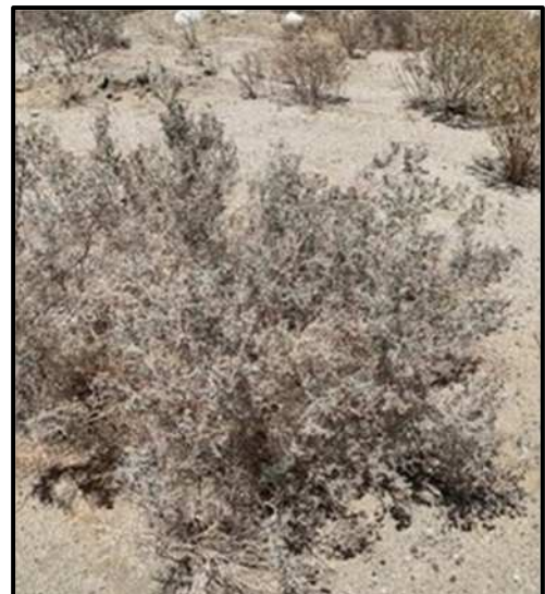
Emory's Indigo Bush ( Psoralethamnus emoryi )

Emory's indigo bush ( Psoralethamnus emoryi ) does not put on a similar springtime show. This 2-3-foot-high perennial shrub remains virtually unchanged and unremarkable all year long. The shrub's intricate, dense branches with small hairy leaves form a mound of grayish-white vegetation in the desert sand, making the plant look as almost as dry as the drought-deciduous brittle bushes.