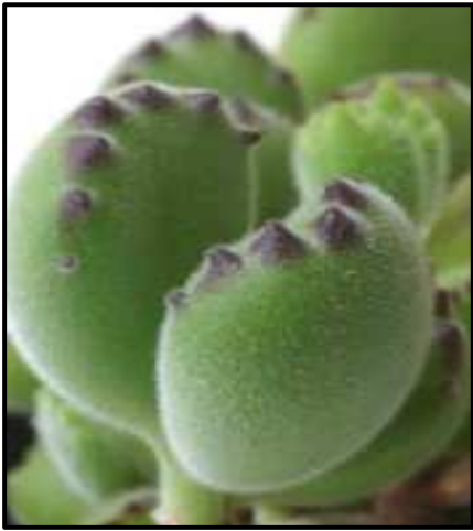
Bear's Paw ( Cotyledon tomentosa )

Both plants require well-draining soil, so their roots do not rot. It seems like these 2 plants have similar requirements so why not plant them together? Their shapes and colors would complement each other, and I'm sure they would feel more comfortable being together in their new Inland Empire home. Unfortunately, their dormant periods are at different times of the year. So, when I should be lovingly allowing my Burro's Tail to sleep during the winter I should be feeding and watering my Bear's Paw. Reverse it during summer when Bear's Paw is dormant, and Burro's Tail is actively growing. I wonder if their origins being from different hemispheres has anything to do with this.