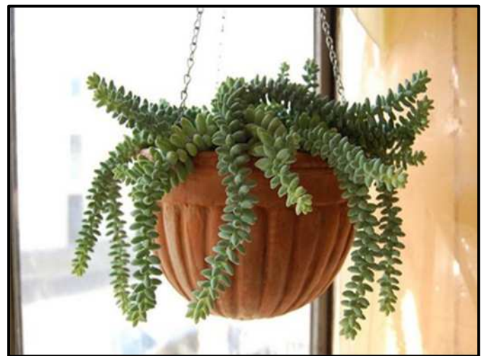
Burro's Tail ( Sedum morganianum )

Burro's Tail is a sedum hailing from tropical southern Mexico and Honduras. It grows blue-green trailing stems up to 2 feet long with teardrop shaped fleshy leaves. In summer, if it blooms, there will be clusters of star-like reddish purple flowers at the end of the tails. Obviously, I will need to find a home for it in a hanging planter. It does not like temperatures under 40 degrees Fahrenheit and does not do well in high temperatures. It loves morning sun, water when soil is completely dry, and low humidity. It does not require misting. If it receives too much sun the leaves will produce a protective wax that will dull their color.