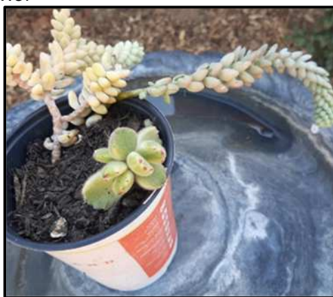
A Tale of Two Succulents