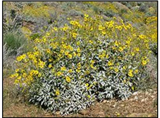
Brittle Bush ( Encelia farinosa )

vibrant show of color. Brittle bush ( Encelia farinosa ) is one example. A profusion of blooms held high on stalks above the foliage put on a brilliant show of yellow on desert hills in years when rains are sufficient. Then, as the dry season approaches, the blooms fade, the plant goes drought deciduous, and the plant drops its gray-green leaves, leaving little more than a skeleton of brittle branches.