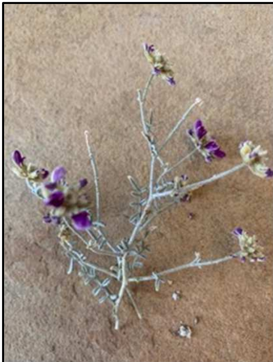
Emory's Indigo Bush ( Psorothamnus emoryi ) in bloom!

Resources: Temalpakh, Cahuilla Indian knowledge and usage of plants , Lowell Bean and Katherine Saubel, published by the Malki Museum Press; Sonoran Desert Naturalist, Field Guide .