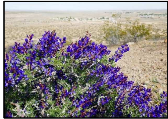
Mojave Indigo Bush ( Psorothamnus arborescens )

This modest indigo bush is a true survivor. It is a member of the Fabaceae or legume family and, as such, has the ability to fix nitrogen; its hairy grey-white leaves help reflect the harsh desert sunlight. The small unobtrusive purple-blue flowers this indigo bush puts on in the late spring to early summer are not particularly showy or eye-catching.