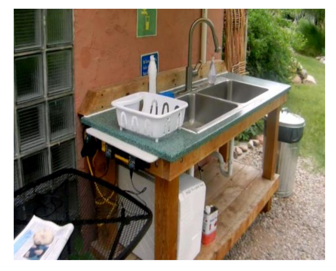
UCCE Master Gardener Program of Riverside County