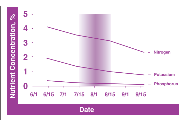
Figure 3.—The change in nitrogen (N), phosphorus (P), and potassium (K) concentration in leaves of 'Meeker' raspberries during the 2001 growing season. Tissue sampling should be done when leaf nutrient concentrations are relatively stable (shaded area).