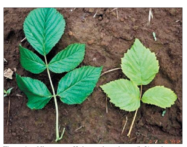
Figure 1.—Nitrogen-sufficient red raspberry (left) and nitrogen-deficient red raspberry (right).

Caneberry plants require chemical elements from air, water, and soil to ensure adequate vegetative growth and fruit production. When levels of these nutrients in the plant are low, growth and yield may be affected. Severely reduced nutrient supply can lead to visible nutrient deficiency symptoms such as leaf discoloration and distortion (Figures 1 and 2). Routine collection and analysis of tissue