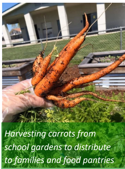
Harvesting carrots from school gardens to distribute to families and food pantries

The UC Master Food Preserver program provides pertinent food safety education during the crisis through social media and newspaper articles, including information on proper handwashing, assessing the safety of shelf stable food at home, how to safely shop for groceries, handle takeout, curbside pickup, and home delivered meals. CalFresh Healthy Living, UC responded to the immediate need to provide education about food security and food safety in English and Spanish . In response to the needs of partnering farmers markets, staff mobilized resources to support social distancing measures at markets where EBT/CalFresh is accepted. Support provided by CalFresh staff include: supervision and onboarding of County Disaster Service Workers to staff high-traffic markets, signage to direct clientele in following social distancing protocols in both English and Spanish, social media posting and circulation of a media release to let the community know that the markets are safe, open, and accessible for people with CalFresh benefits. To further support the food system and food security efforts, staff maintain and conduct essential work in established school gardens to ensure food does not go to waste. Harvested produce has been delivered to school food service for school meals, distributed to families, and donated to a local food pantry.