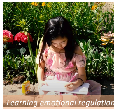
Learning emotional regulation

The Youth, Families & Communities Program in San Luis Obispo County is supporting the socio-emotional health and wellbeing of students, families, and educators during the crisis. They developed 10 free virtual lessons on How to Practice Mindfulness with Kids . Research on this peer-reviewed curriculum demonstrated that the lessons help participants increase their personal skills in mindfulness practices, ultimately leading to improved stress management and emotional regulation. Students from the Central Coast are featured in the lessons, which have been distributed to Superintendents in all San Luis Obispo County school districts.