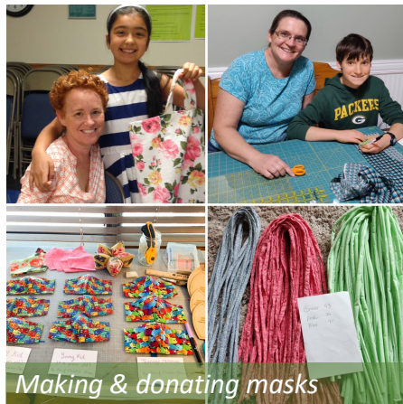
Making & donating masks