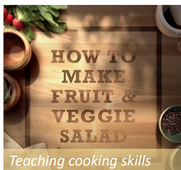
Teaching cooking skills

CalFresh Healthy Living, UC community education staff in San Luis Obispo County developed videos to assist educators and students, which include reading books, cooking healthy recipes and engaging in physical activity during Shelter in Place. These videos were provided to school principal to distribute through their channels while the schools were working hard to get students the tools they needed to connect online. Community educators continue to develop resources for teachers and students during the crisis creating, posting and sharing new content daily in both English and Spanish on social media.