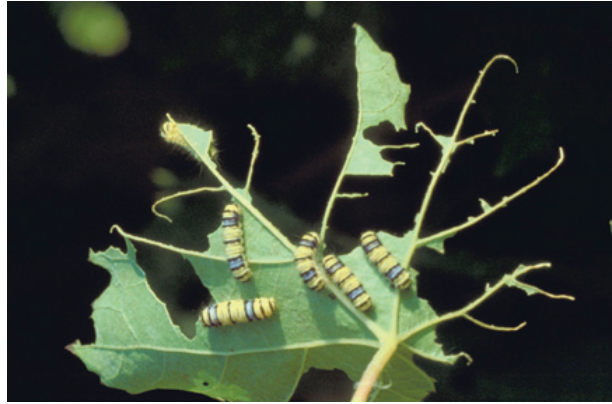
Fifth stage larvae feed individually and "skeletonize" leaf leaving only main veins