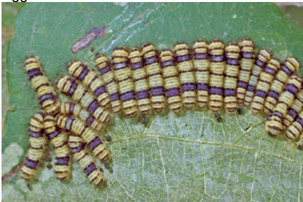
Fourth stage larvae feed side-by-side