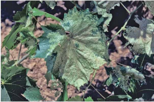
Damage caused by 1st - 4th stage larvae feeding on underside of leaf

LOOK FOR THIS MOTH AND THE LEAF DAMAGE IT CAUSES