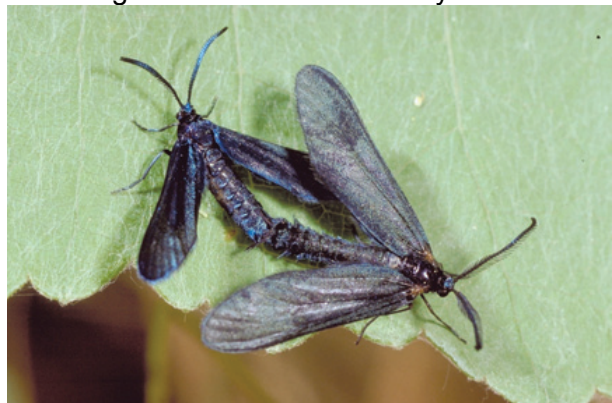
Male and female moths of Harrisina brillians

Sonoma County Agricultural Commissioner (707) 565-2371 UC Cooperative Extension Sonoma County (707) 565-2621