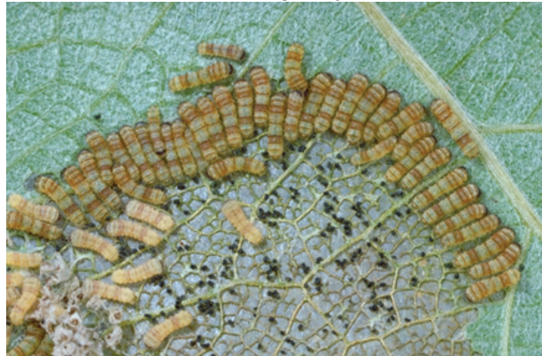
Third stage larvae feed as a group