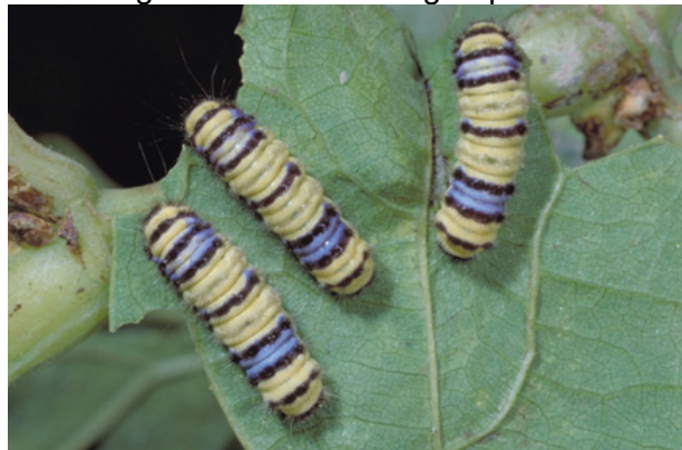
Fifth stage larvae feed individually

Look for this pest on: Grape , Boston Ivy , and Virginia Creeper