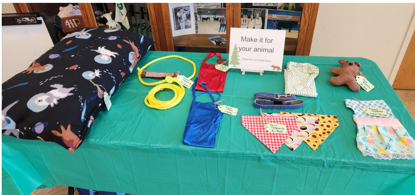
2023 Make It for Your Animal entries