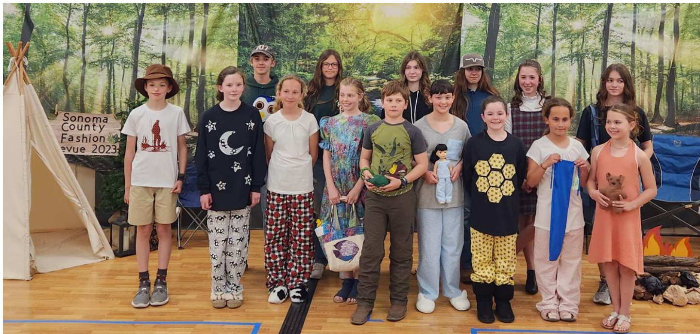
Most of the participants of the 2023 Sonoma County Fashion Revue