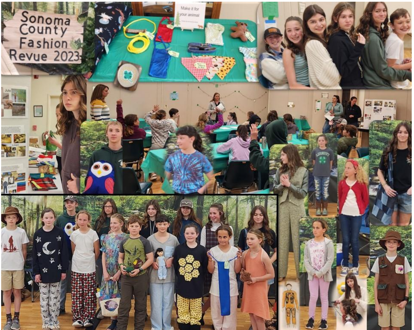
Fun at the 2023 Sonoma County Fashion Revue