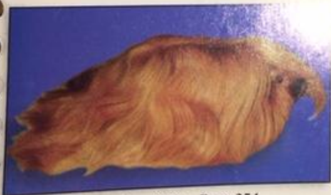
Peruvian Satin - Page 254