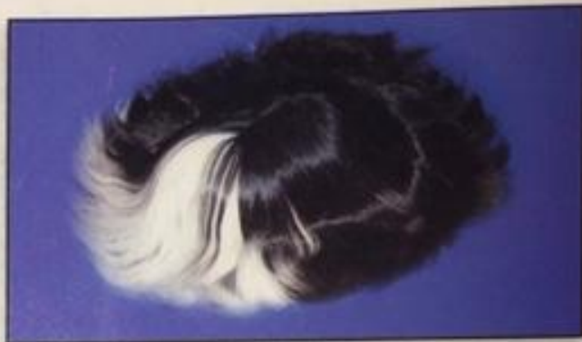
Peruvian - Page 252