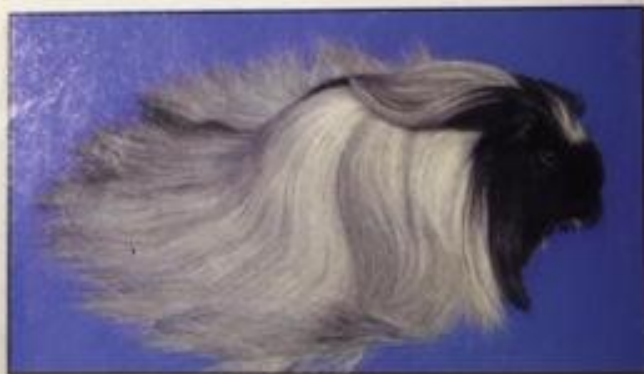
Silkie - Page 256