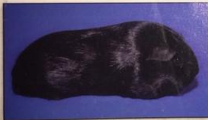
American - Page 246