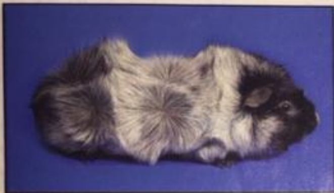
Abyssinian- Page 242