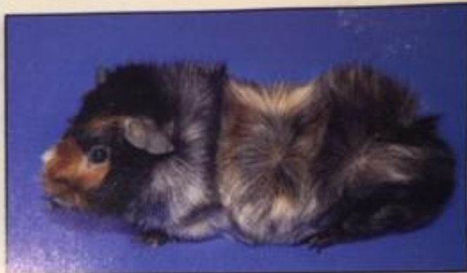
Abyssinian Satin - Page 244