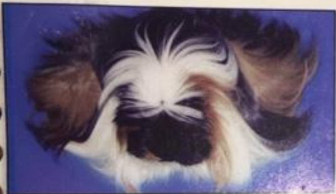
Coronet - Page 250