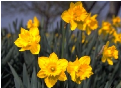
Daffodils can cause convulsions in pets when eaten.

A large number of plants commonly found in yards and in homes contain some amount of natural toxins, which can range from mildly toxic to life threatening when pets eat them. In some cases, the entire plant is toxic to pets; in others, only some parts of the plant are toxic. Most bulbs and seeds are very toxic to pets; bulbs and seeds should be stored away from them. To be on the safe side, plant litter (such as trimmed flowers, stems and leaves) should be discarded appropriately.