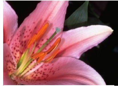
Lily ingestion can cause kidney failure, especially in cats.

Although we have had puppies in the house before, our current youngster can't resist lunging at, and chomping off, parts of plants that are hanging off trails or walkways as he goes by them. This is typical of young pets (and kids) as they explore the world using all of their senses... including taste. Clearly, I needed to familiarize myself with plants that could be poisonous to puppies. My research led me to a plethora of information about plants toxic to pets, but more importantly, I found some excellent websites to keep handy in case this puppy manages to chew on some dangerous plants.