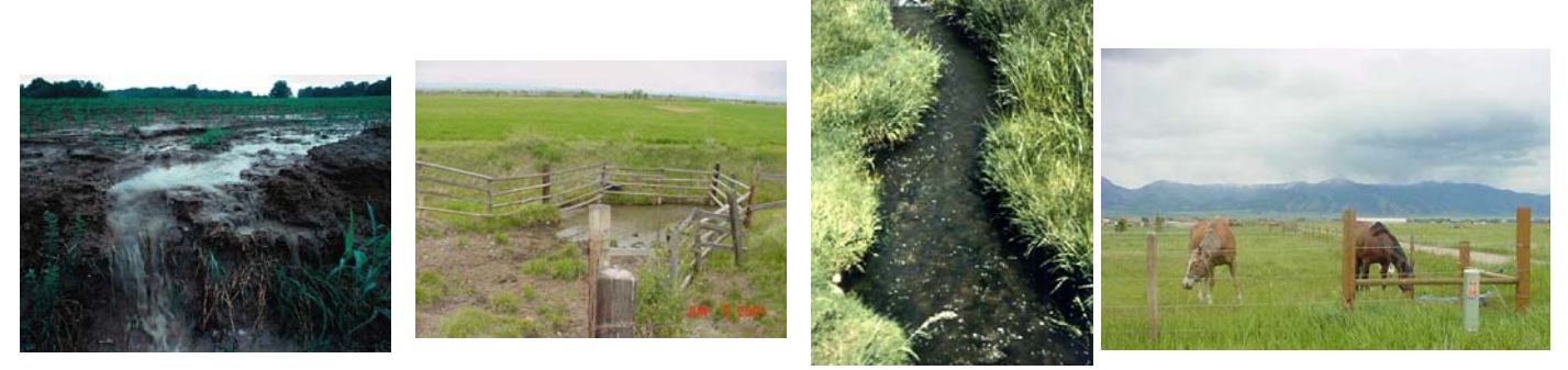
Manage vegetation to minimize fecal-stream interaction, filter tail water before it returns to creeks, don't irrigate under livestock, minimize livestock's direct access to creeks