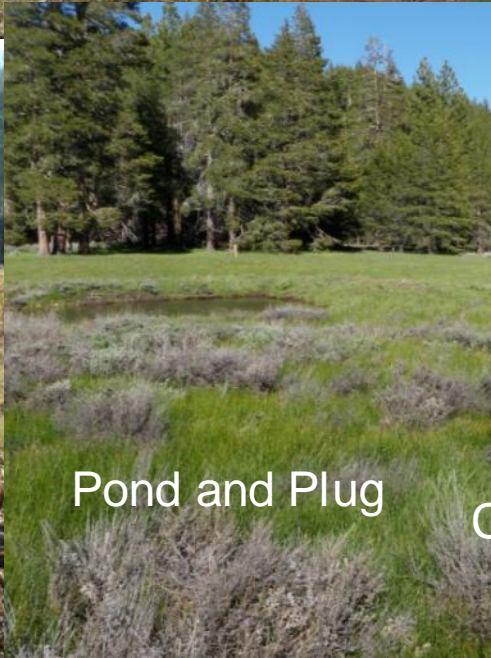
Pond and Plug