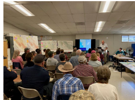
Public Meeting for Wildfire Protection Plan

Our Cooperative Extension (UCCE) county-based advisors, community educators, and campus-based academics work as teams to bring practical, trusted, science-based solutions to our state. We are problem solvers, catalysts, collaborators, educators, and stewards of the land, living in the communities we serve.