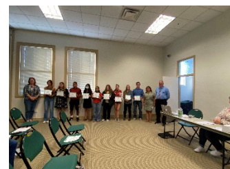
4-H Senior Scholarships