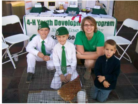
Palos Verdes Peninsula 4-H Club members dressed up in chicken and rabbit costumes to spur on passersby to attend the 4-H Pet Symposium. The youth even made signs and danced on the sidewalk! Way to go PVP 4-H!