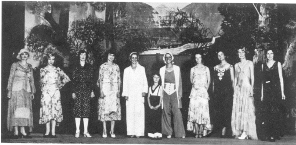
Florida 4-H Fashion Revue of years past

This tradition in 4-H is well-loved and long-standing, and not only is it interesting, but important, to know a little bit about the history of the Fashion Revue, why we do it, and what skills can be learned from participating in this fun and exciting event.