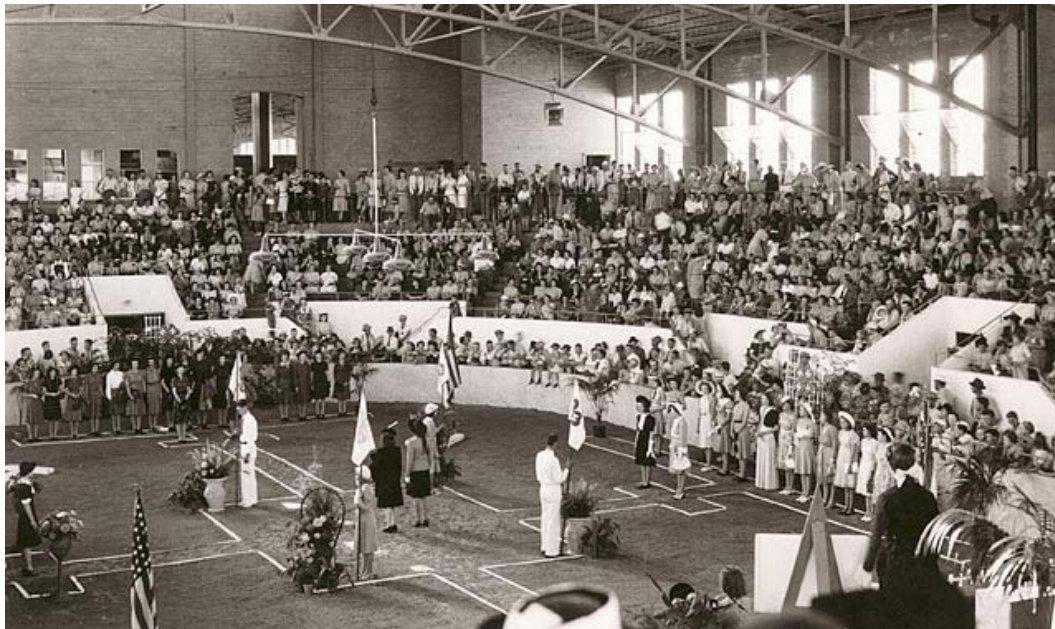
Nebraska State Fair 4-H Style Show, 1940

The early Fashion Competitions & Revues extended to County Fair Competitions, and eventually to State Fair Competitions and Style Shows.