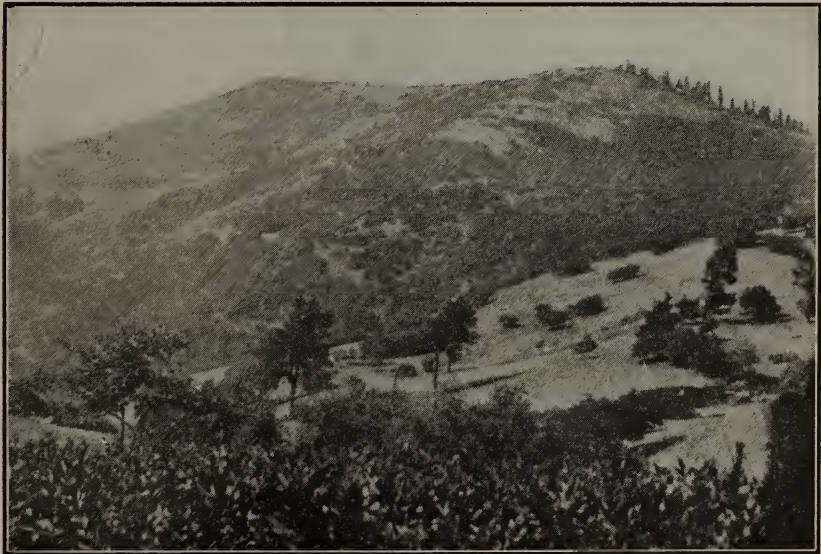
SIGNAL PEAK, IN EASTERN MENDOCINO COUNTY.

Slopes covered with low-growing Quercus garryana , and open places where covering has been killed by sheep. In the foreground is False Hellebore ( Veratrum ), an indication of moist ground.