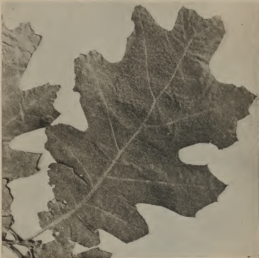
PLATE VII. QUERCUS CALIFORNICA. (BLACK OAK.)

The Maul Oak ( Q. chrysolepis ), when found growing on well-watered and protected slopes, is a tree 40 to 60 feet in height, with large sweeping branches. On exposed slopes, however, and on the upper ridges and peaks, it becomes a gregarious shrub with Q. garryana . The leaves are oblong, acute or cuspidate, entire on old trees but spinose-dentate on young ones and on shoots. They are pale and glaucous above, with