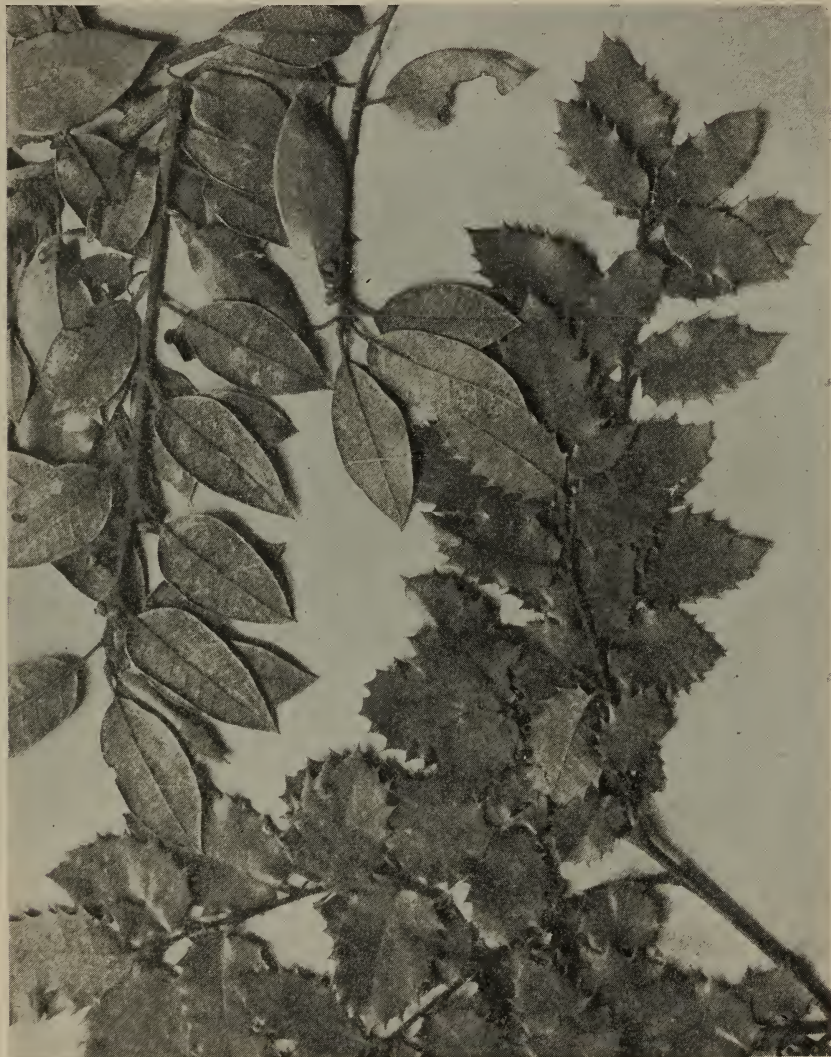
PLATE VI. QUERCUS CHRYSOLEPIS. (MAUL OAK.) Showing two distinct leaf forms.

The shrub is common in the chaparral with Quercus dumosa , and ranges with it in altitude. It is well distributed in the Coast Ranges from Mount Shasta to San Diego County, usually at quite a distance