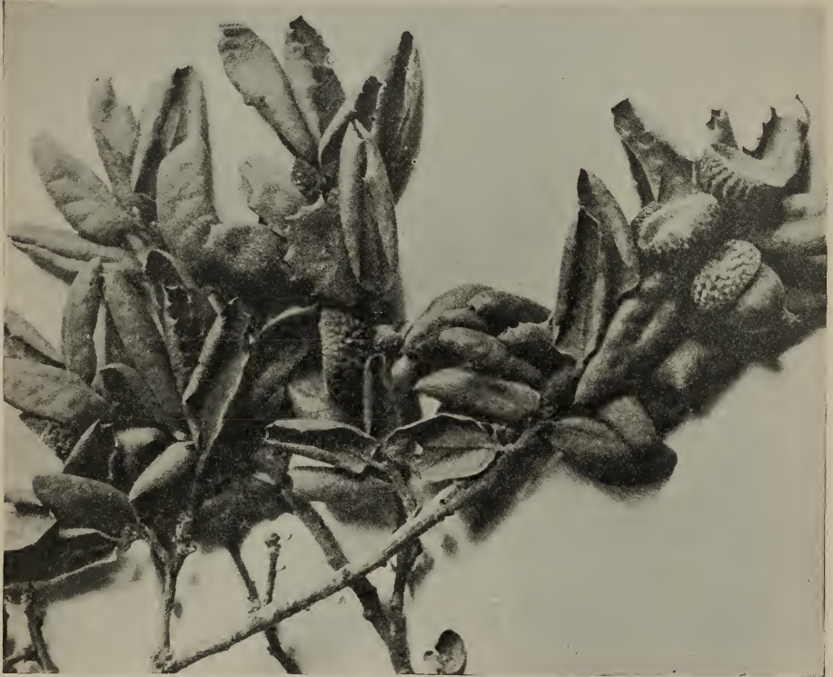
PLATE IV. QUERCUS DUMOSA , VAR. BULLATA . (CURL-LEAF SCRUB OAK.)

This shrub, on account of its low habit of growth, is particularly adapted to browsing, and is one of the best for sheep and goats. Cattle, however, dislike it on account of its harsh, spinescent leaves, but feed on it during the winter when snow has covered the ground, or when from any cause other food is not available.