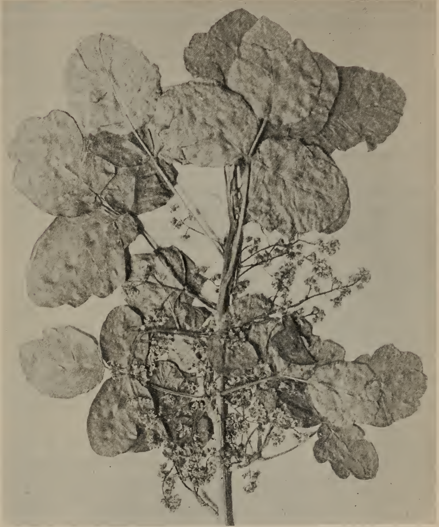
PLATE X. RHUS DIVERSILOBA. (POISON OAK.)

In summing up the value of these California oaks, the common classification into "live," or evergreen, and deciduous will be made. The former class includes Scrub Oak and Curl-leaf Scrub Oak ( Quercus dumosa and variety bullata ), Cañon Live Oak ( Q. wislizeni ), and Maul