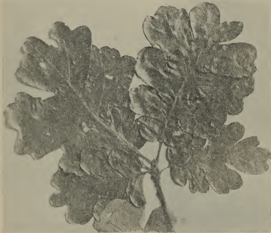
PLATE VIII. QUERCUS GARRYANA. (MOUNTAIN WHITE OAK.)

The Black Oak is a tree 18 to 30 feet high, usually with several large erect branches. It is generally found near coniferous trees, and apparently occupying the same belt. Young trees often occur in dense growth, and, when in this condition or when overshadowed by other trees, grow slowly, thus enabling stock to browse on them. The leaves of young trees are covered with a dense gray tomentum below, and are pubescent above. On older trees the leaves are glabrous with little tomentum. They vary