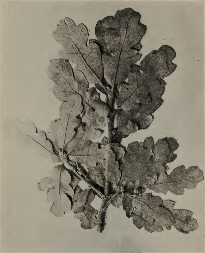
PLATE I. QUERCUS DOUGLASII. (BLUE OAK.)

In altitude, this oak is limited to the low foothills and dry valleys where the soil is hard and rocky, and never ranges upward to the higher slopes and valleys. It is found most abundantly in the dry foothills of