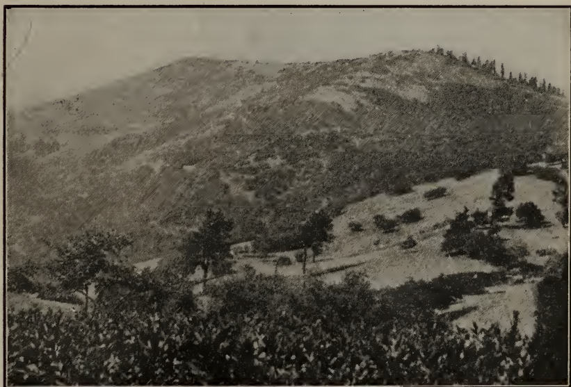
SIGNAL PEAK, IN EASTERN MENDOCINO COUNTY.

Slopes covered with low-growing Quercus garryana , and open places where covering has been killed by sheep. In the foreground is False Hellebore ( Veratrum ), an indication of moist ground.