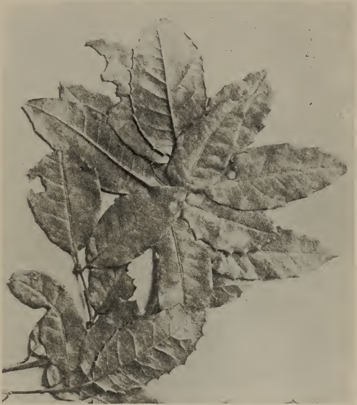
PLATE V. QUERCUS WISLIZENI. (CAÑON LIVE OAK.)

The forage value of the variety is apparently the same as that of the type of the species.