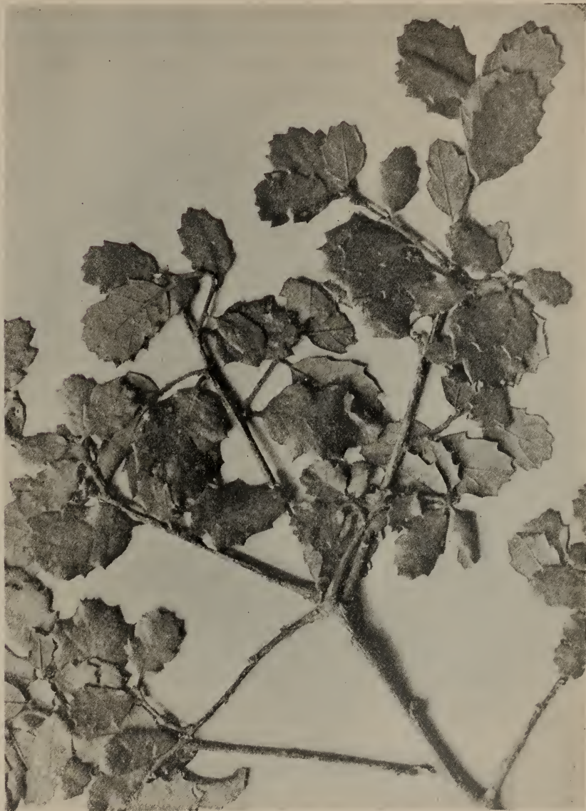
PLATE III. QUERCUS DUMOSA. (SCRUB OAK.)

leaves are oblong to obovate and entire on the older trees, but are often sinuate-toothed and spinescent in young shrubs. They are pale green in color and pubescent on the lower side. The acorns are oval and