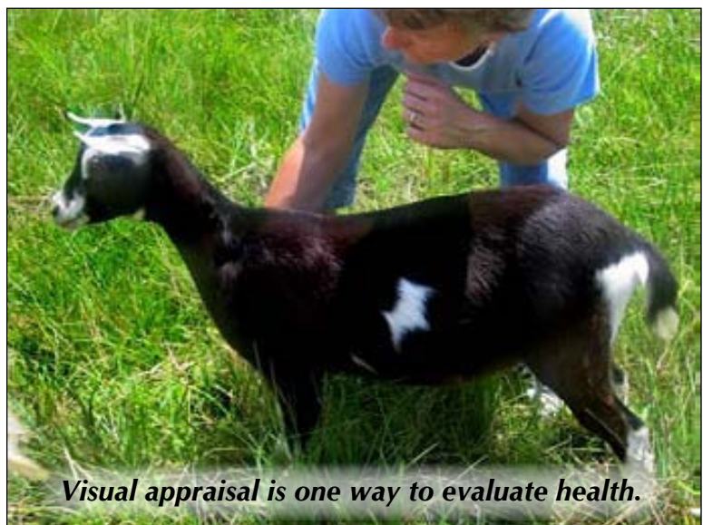
Visual appraisal is one way to evaluate health.

Third, ask that tests be run on the does you are considering. These tests will increase the