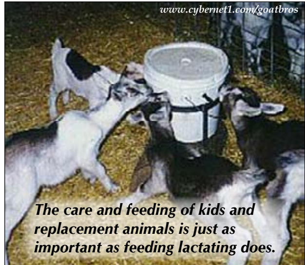
The care and feeding of kids and replacement animals is just as important as feeding lactating does.

in the amount of grain fed after kidding. (Morand-Fehr, 1978)