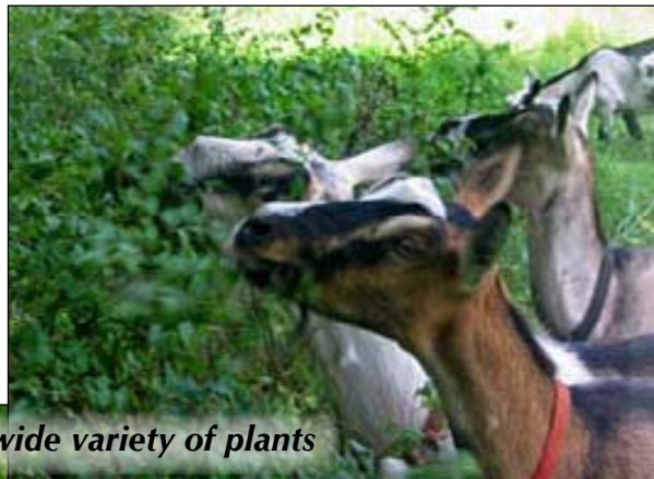
Goats will eat a wide variety of plants

...I also noticed that the goats have an incredible sensitivity to pasture quality. I was expecting this to some degree, but not to the degree that