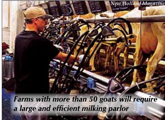
Farms with more than 50 goats will require a large and efficient milking parlor

and money, but it is time and money well spent. It is cheaper to prevent disease and contamination than to treat it. A good reference for producers considering a commercial dairy is the Small Ruminant Guidelines from the Dairy Practices Council. These Guidelines include a wealth of technical information about the details of setting up a milking parlor, producing quality milk and farm-