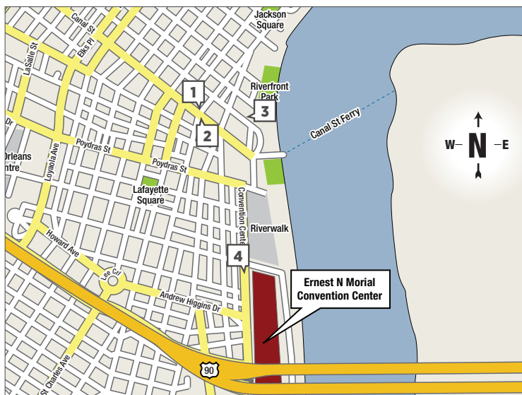
Map used to indicate approximate locations only.

Rates do not include current tax of 13% or applicable surcharges, subject to change.