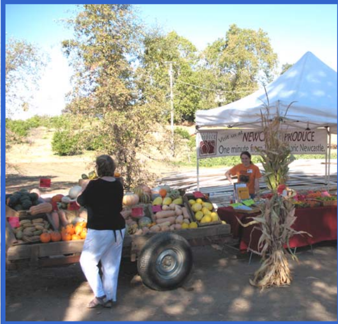
Fresh produce for sale at Twin Brooks Farm in Loomis on the 2010 Farm and Barn Tour.

From one 2010 Tour participant: “We love to see the farms where our produce grows!”