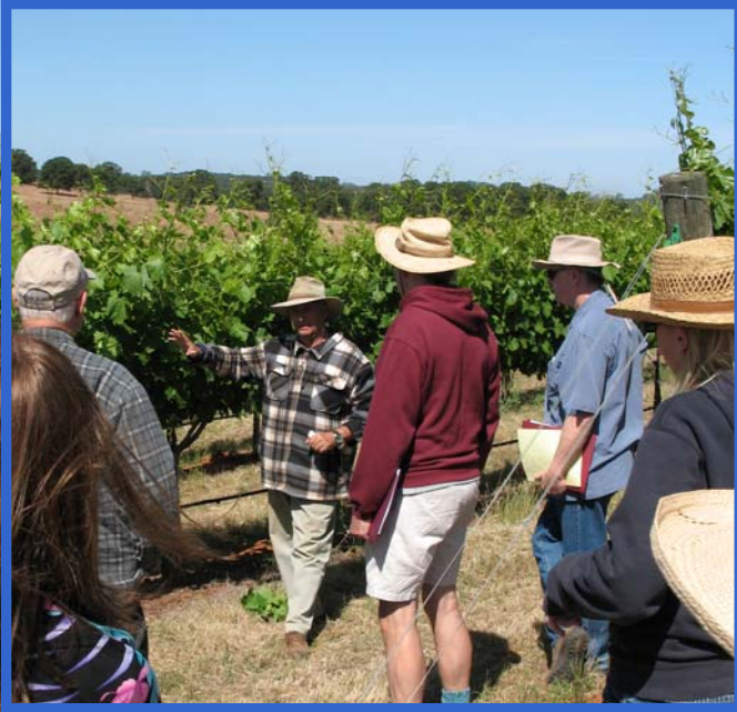
Vineyard Field Day, Naggiar Vineyard.