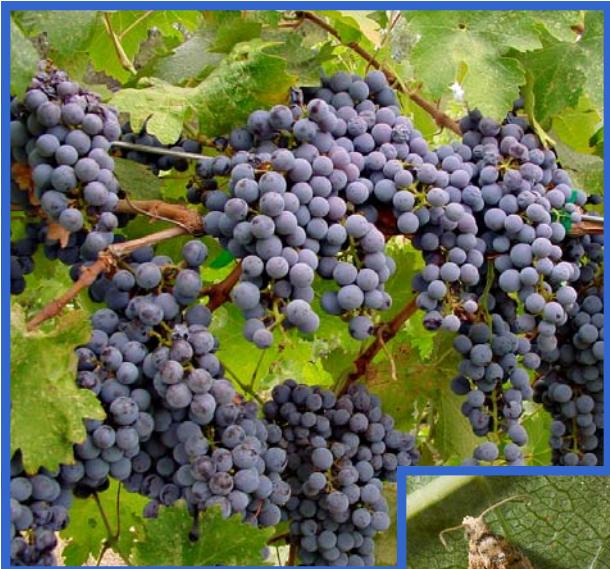
A quarantine for European grape-vine moth is now affecting Nevada County grapegrowers.