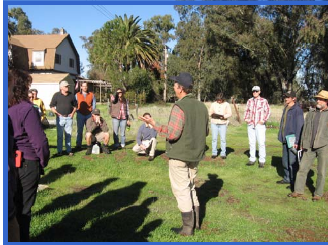
Sierra CRAFT Vegetable Soil and Water Management Workshop in December 2010.

Most growers in Placer and Nevada Counties farm on small acreages, at the rural-urban interface. The