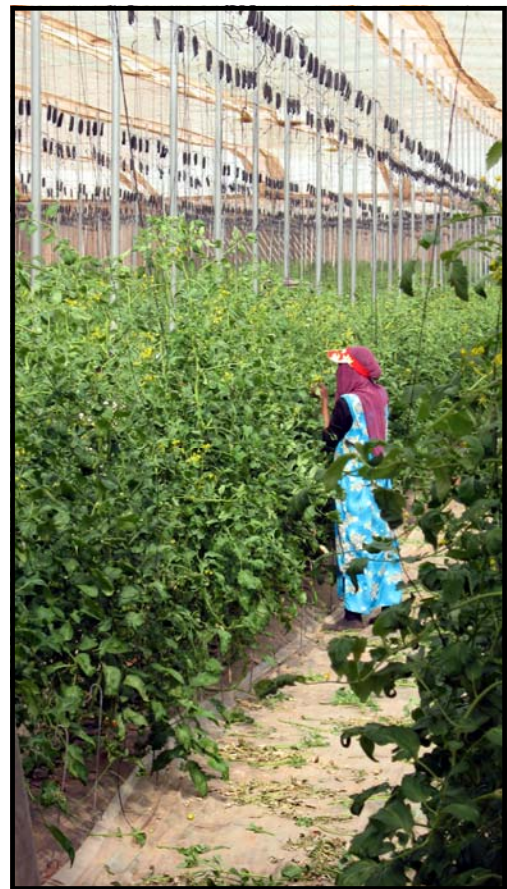
Cherry tomato harvest near Agadir, Morocco.

Interest in protected cultivation is increasing in the foothills, as it can lengthen short cropping seasons and extend production of warm season crops into cooler weather. This can increase revenues and improve cash flow, increasing the economic viability of small farming operations. A number of area growers have taken advantage of the USDA cost share program for construction of high tunnels, so a number of high tunnels are currently in the planning or construction phases. As the practice becomes more common, the need for information and production techniques tailored to the exigencies of protected cultivation will be needed. My experience in North Africa will be very useful in helping growers learn about these new production techniques.