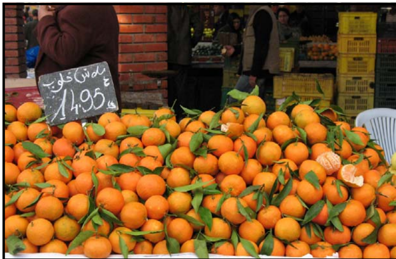
Tunisian Mandarins in Central Market, Tunis, Tunisia.

Citrus is a key crop for foothill horticultural producers and mandarins are the signature crop in Placer County. While most of our production is sold locally, a small amount is shipped to the East Coast and throughout the US. Growers are always interested in new varieties, production techniques, and developments in the global citrus market. The majority of mandarins sold on the East Coast are from North Africa and Spain, so I chose to spend a part of my sabbatical leave learning about citrus production in Morocco and Tunisia.