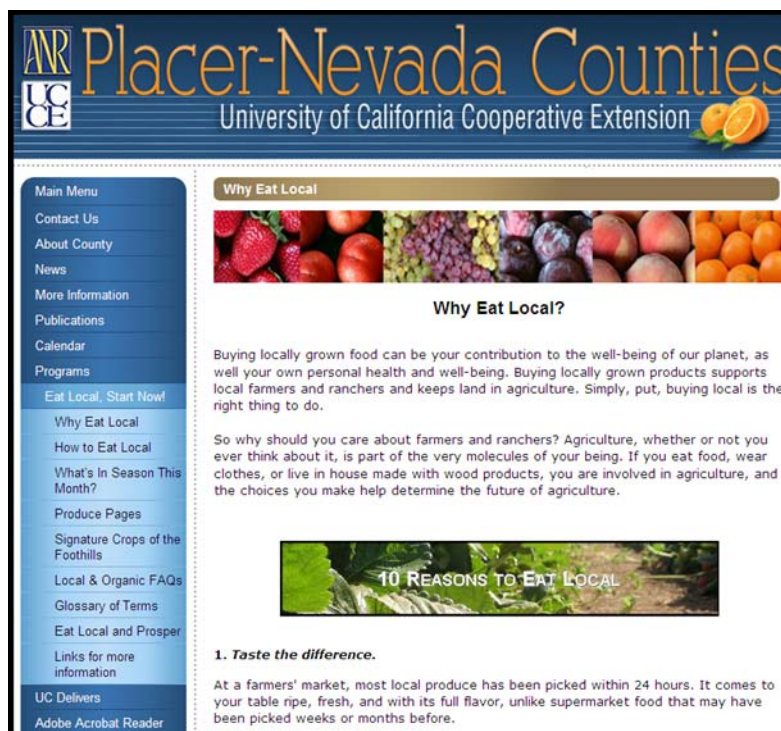
Eat Local, Start Now web page.

More and more prospective producers are finding their way to UCCE’s programs and services through our website. Response to recent programs has come through the horticulture web pages, indicating the value of the site in providing information and resources. Local consumers are also finding useful information to inform their food purchases on the Eat Local pages.