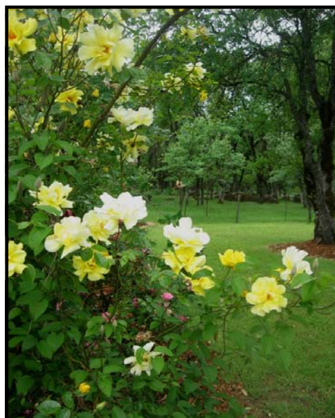
2010 Garden Tour site.

The annual Mother's Day Garden Tour was created to provide a venue for education, fun, and exploration. Each year, 6 gardens are showcased around different communities in Placer County and offered as a special Garden Tour where residents can not only get answers to their gardening questions but also see good gardening practices in action. The gardens chosen for the tour are extraordinary private home gardens that would otherwise be hidden from the view of the greater community. This year, the Placer County Master Gardeners celebrated their 25th Annual Mother's Day Garden Tour.