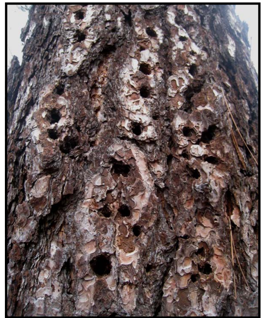
What are these holes in my Pine tree?

With the interest in growing food increasing, the UC Master Gardener HOTLINE's will continue to serve the public and be a valuable resource for home gardeners. As the capability to staff the HOTLINE's increases with more and more volunteers being trained through the UC Master Gardener Program, the benefit to the community will also likely grow. The Hotline in both counties answers questions on pest management, soil fertility, plant identification, and more.