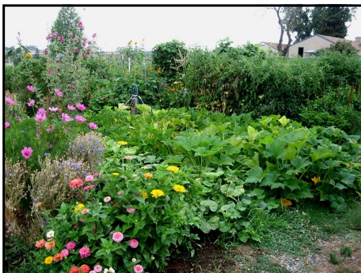
A thriving Senior Garden plot.

There are many senior citizens in our counties who live in senior housing, apartments, and other homes that lack outdoor space for gardening. They do not have the opportunity to experience the numerous benefits that gardening offers