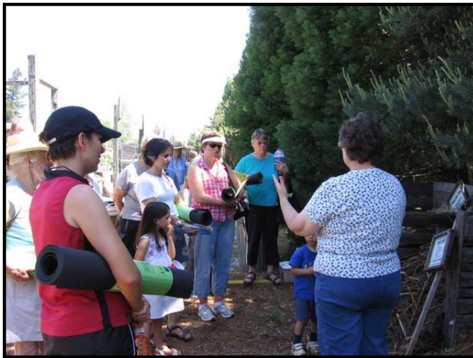
Residents first learn about how to compost and then go home with a bin to get started!

With increasing populations and decreasing landfill space, there is a growing need for viable options in the area of waste management. The majority of materials that flow into our landfills are organic materials that can be diverted, processed, and used in positive ways throughout our communities. A great deal of the organic materials usually hauled to the landfill can be composted at home. Backyard composting not only diverts waste from landfills but also provides the homeowner with a wonderful soil amendment. Composting also benefits air quality as many of the organic materials that are annually burned can be composted instead.