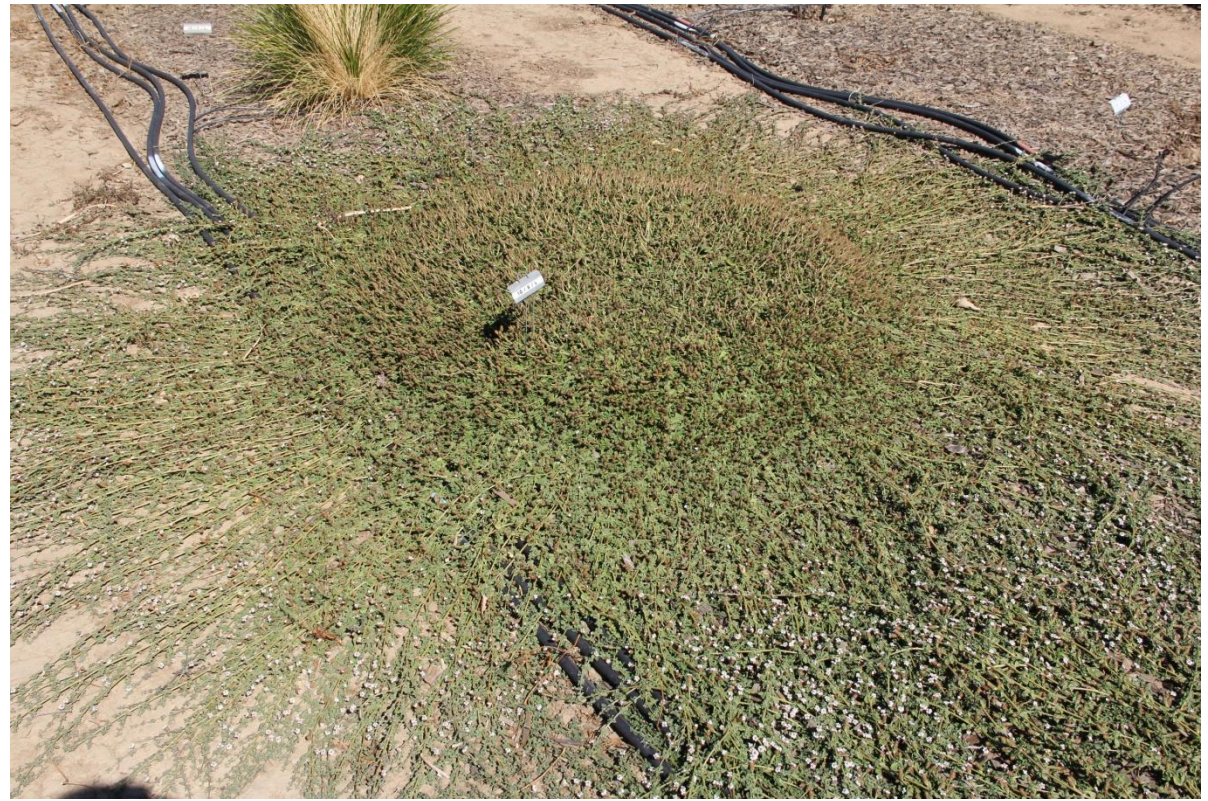
Fig. 11. Kurapia on 20% of ET_0 in October 2014. It has grown into adjacent plants 2 m away.