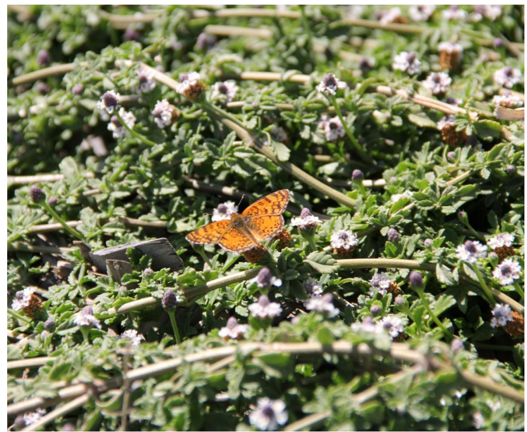
Fig. 13. Butterfly on Kurapia in May 2014.