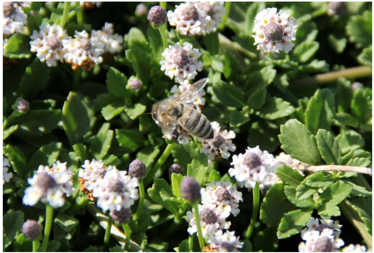
Fig. 12. Bee on Kurapia flower in May 2014.