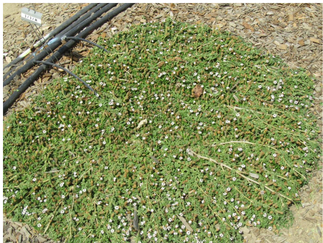
Figure 3. Kurapia in Sept. 2013, after 1 year in the ground, trimmed to 1 m wide.