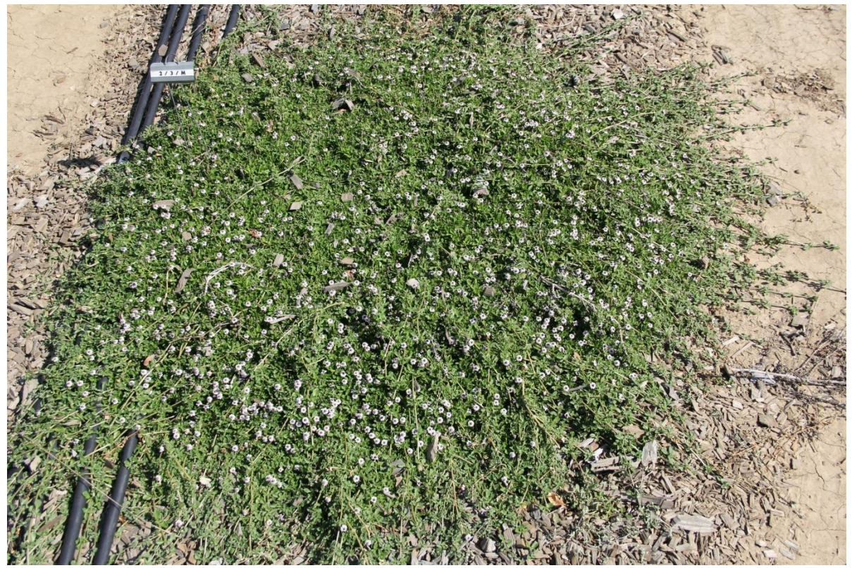
Fig. 6. Kurapia in May 2014, more than 1 m wide, blooming.