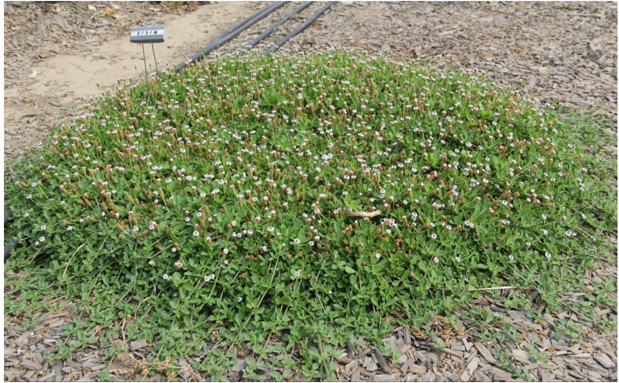
Fig. 8. Kurapia on 40% of ET_0 irrigation in July 2014 already outgrowing its pruning.