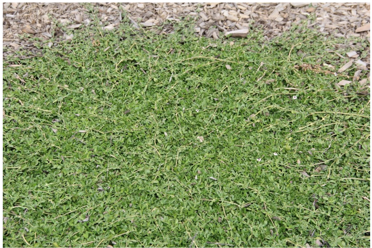
Figure 5. Kurapia in late April 2014, recovered and filled in.