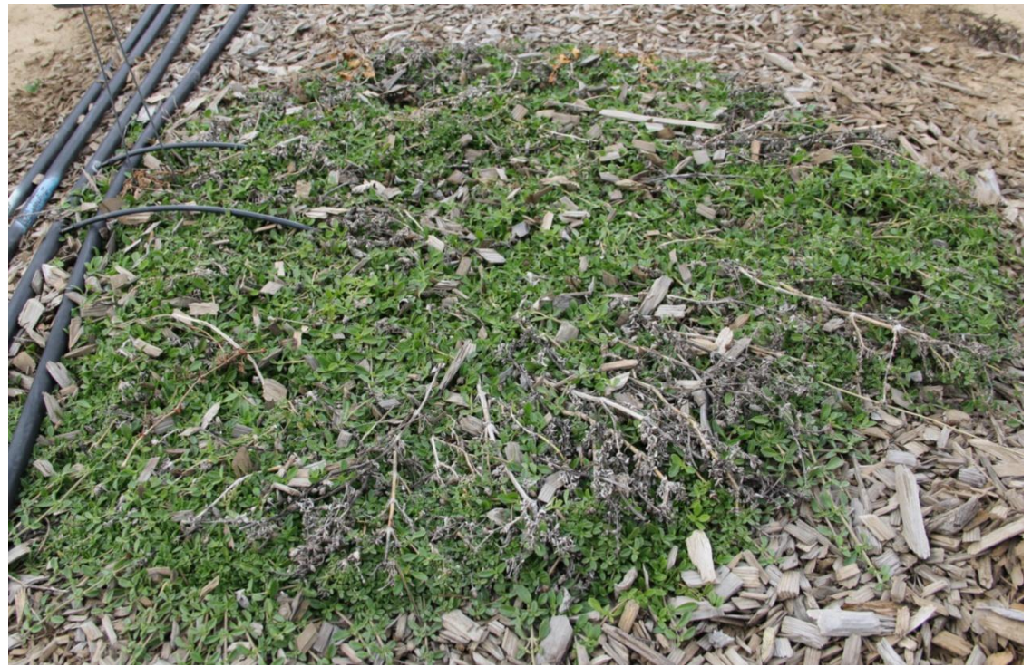
Figure 4. Kurapia in late March 2014, still showing winter damage.