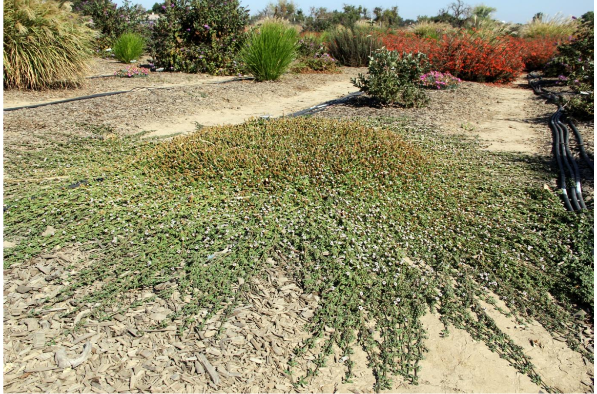
Fig. 10. Kurapia on 20% of ET<sub>0</sub> in September 2014, still blooming around the edges with brown flower heads in the middle.