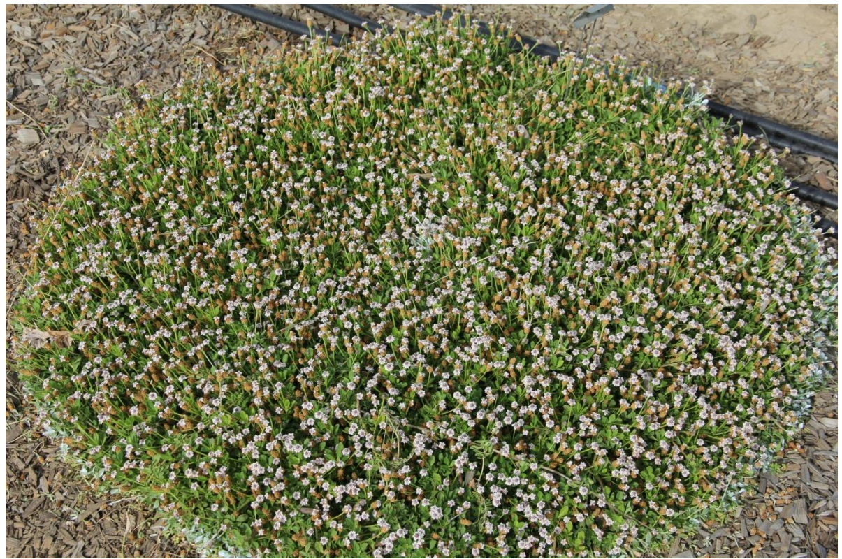
Fig. 7. Kurapia in June 2014, in full bloom, pruned to 1 m-wide circle.