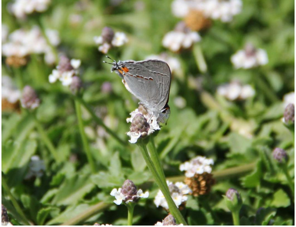
Fig. 14. Butterfly on Kurapia in May 2014.