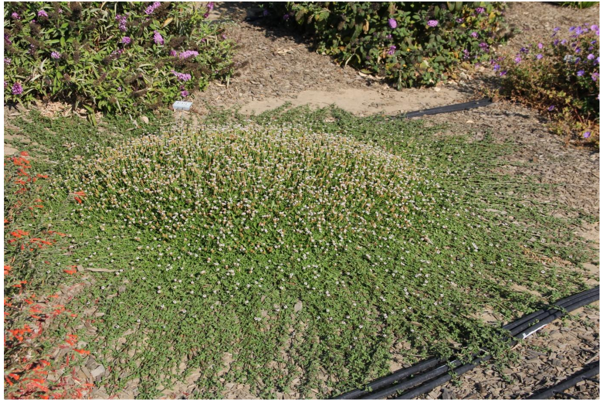
Fig. 9. Kurapia on 80% of ET<sub>0</sub> completely outgrowing its allotted space by August 6, 2014.