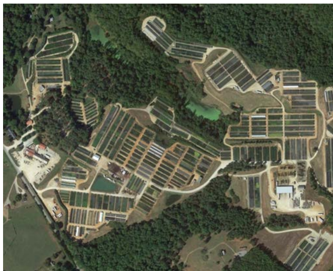
Figure 5. Satellite image of Saunders Brothers, Inc. container nursery from Google Earth. Downloaded Jan. 2019 from Google Earth.

three years. They made adjustments to irrigation based on both short-term (i.e., daily) and long-term (i.e., seasonal) changes in plant water needs. Short-term adjustments dealt with changes in water usage due to weather, specifically temperature, solar radiation, and ET. Long-term adjustments dealt with changes due to crop status, specifically spacing, pruning, and crop age. Through these approaches, the nursery recorded a decrease in chlorine and electricity usage. Also, reduced leaching of nutrients from excess watering, along with a drier substrate surface between irrigation events, decreased weed seed germination. The nursery was able to reduce fertilizer inputs by 25-35% for certain crops and lengthen time between herbicide applications. The cost per LF measurement was estimated to be $1.19 (based on Adverse Effect Wage Rate of $11.46 per hour and 2.5 person hours per week). The nursery measured eight zones each week (three measurements per zone for 24 total measurements) at an estimated annual cost of $1,490. Saunders Brothers estimated that reduced input costs and reduced plant losses due to improved irrigation practices have saved the company in excess of $70,000.