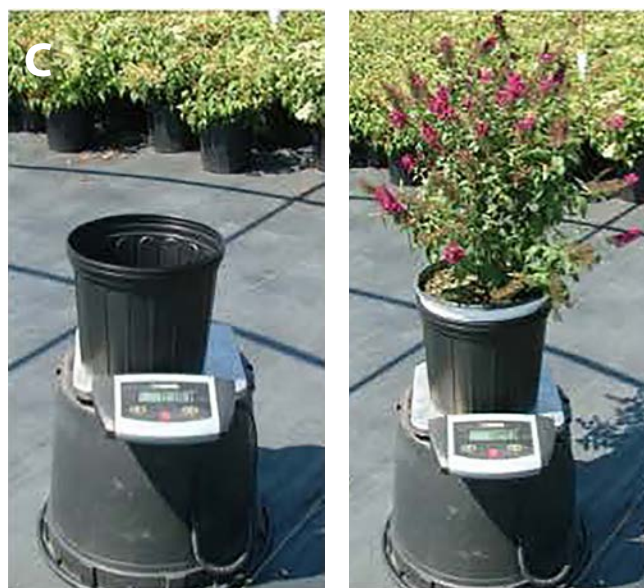
Figure 3. (A) Setup of empty, unplanted container (left) and planted container (right) nested in 5-gallon buckets with holes cut in the lids to measure volume-based leaching fraction. (B) Volume of micro-irrigation water applied by placing spray stake in a 1-gallon milk jug and placing the planted container on pipe ring in a plant saucer (right) to measure volume-based leaching fraction. (C) Weight measurement of solid (no drainage holes) container to catch leachate (left) and planted container nested in leachate-collecting container (right). (Images by Jim Owen [A, B] and Jane Stanley [C].)