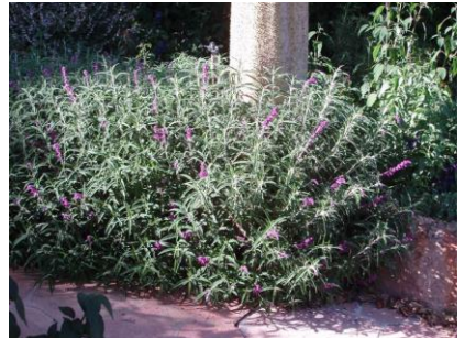
Mulching, watering with drip irrigation, managing storm water runoff, and reducing yard waste are key sustainable practices.