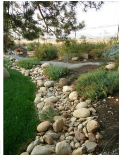
Permeable pathways and intermingling food producing plants with herbs and ornamentals are elements of Central Valley Style.