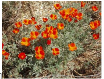
Using native plants to encourage pollinators, birds, beneficial insects and other wildlife is a key element in Central Valley Style gardens.