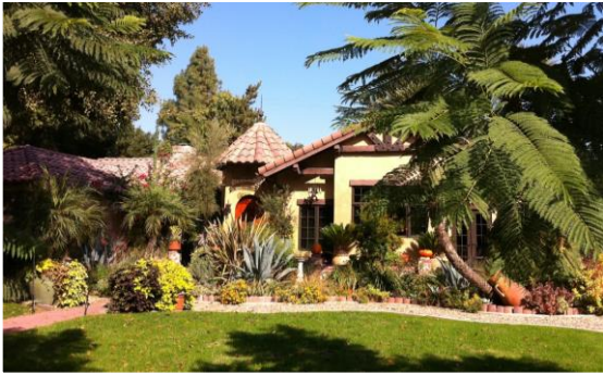
The Central Valley has many forms of architecture and garden themes. Innovative designs using climate appropriate plants and reduced lawn size help make these gardens Central Valley Style.