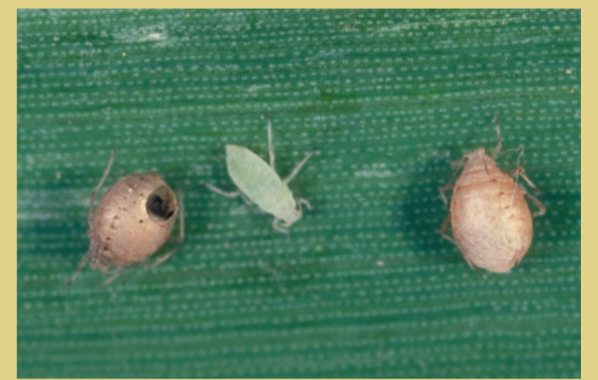
Parasitized aphids die and turn into crusty "mummies" that can be black or beige. The hole in the mummy at left indicates a parasite has emerged. The aphid in the middle is healthy.