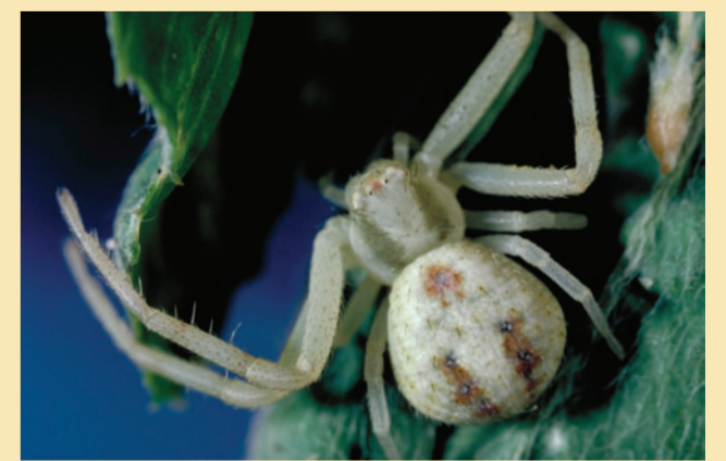
Spiders , including this crab spider, attack all types of insects.