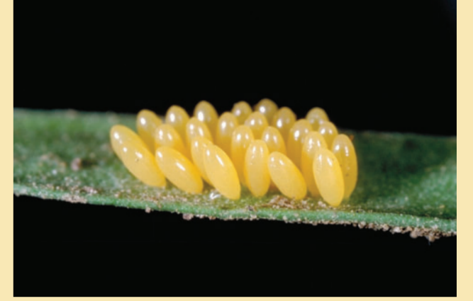
Convergent lady beetles prefer to eat aphids but sometimes eat whiteflies and other soft-bodied insects. Shown here are the adult (left), larva (center), and cluster of eggs (right).