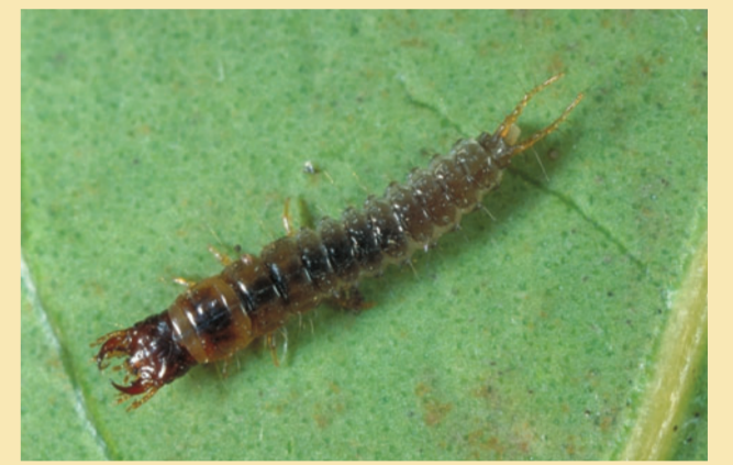
Predaceous ground beetle larvae live on soil and in litter, feeding on almost any invertebrate.